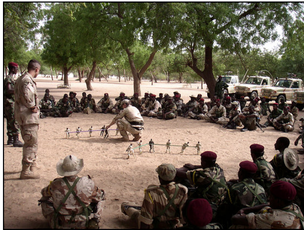
US forces in Chad use GI Joe toys to demonstrate counter-terrorist tactics in July 2005