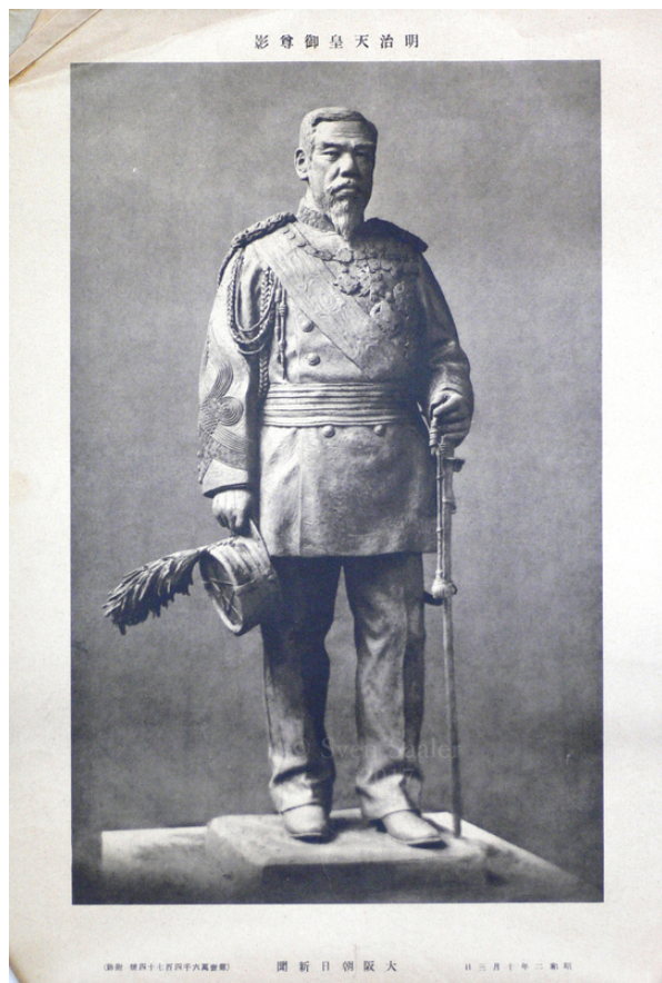
Newspaper insert showing a life-sized statue of Meiji Tennō (1927).

At least one copy of this statue at its original size (175 cm) was cast in later years and was owned privately by Tanaka Mitsuaki. In 1929, Tanaka founded a memorial hall dedicated to Meiji Tennō in Ibaraki, the Jōyō Meiji Kinenkan (Jōyō Meiji Memorial), and donated his Meiji statue to the museum, where the “Sacred Statue” ( seizō ) remains on display to the present day. (Today the museum is known as the Ōarai Museum of Bakumatsu-Meiji History or Bakumatsu to Meiji no Hakubutsukan.) 7