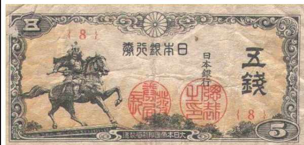
Five-sen bill of 1944 showing the statue of Kusunoki Masashige.

Although many prewar statues were destroyed during World War II, most of these early Meiji period statues survived to the present day. While they have become important landmarks symbolizing the sites where they stand, they also remain significant manifestations of the nation in public spaces, inculcating visitors with an official imprimatur of the idea of the nation. More importantly, their presence is not limited to the actual sites where they stand: they occupy a significant place in the mass media in modern Japan, being reproduced on woodblock prints (see illustration 2), lithographs, postcards (illustration 5), in tourist guidebooks and periodicals, on the internet and in advertisements (illustration 3), as well as on Japan's currency (illustration 4).