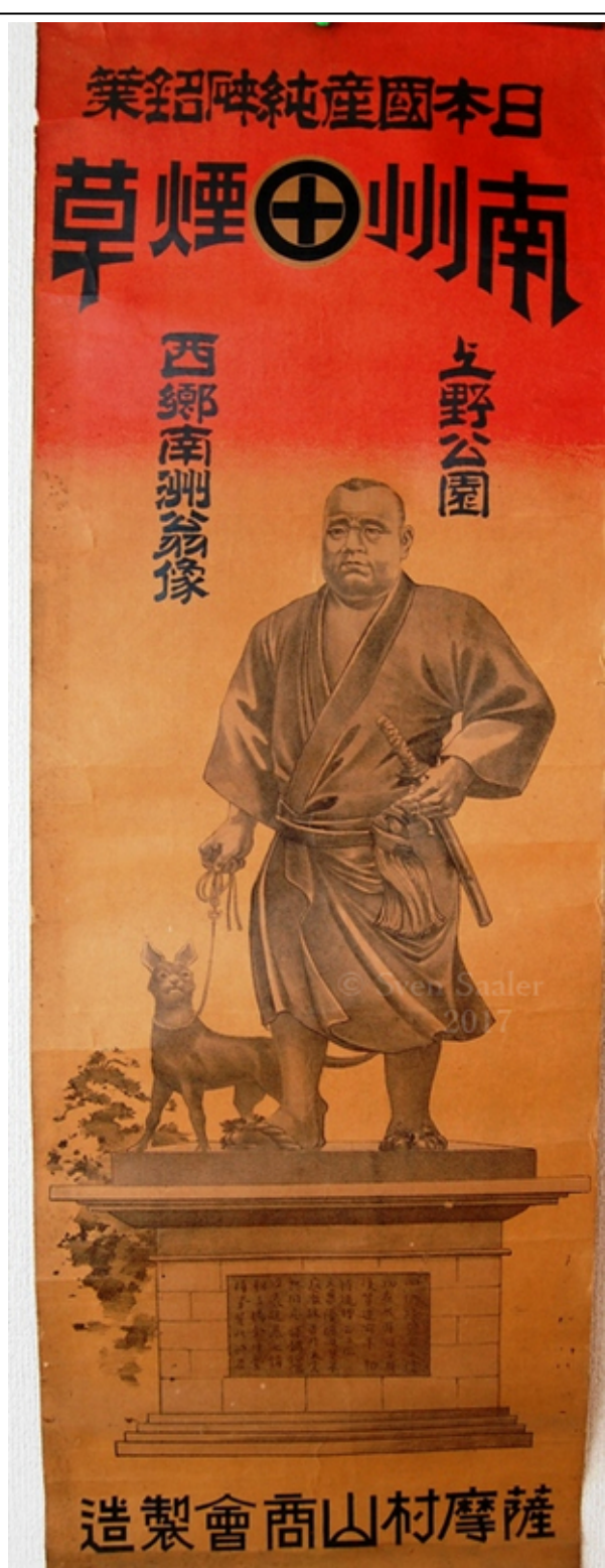
Tobacco advertisement showing the statue of Saigō Takamori in Ueno Park, Tokyo (late Meiji/Taishō period, © Sven Saaler).

Although many prewar statues were destroyed during World War II, most of these early Meiji period statues survived to the present day. While they have become important landmarks symbolizing the sites where they stand, they also remain significant manifestations of the nation in public spaces, inculcating visitors with an official imprimatur of the idea of the nation. More importantly, their presence is not limited to the actual sites where they stand: they occupy a significant place in the mass media in modern Japan, being reproduced on woodblock prints (see illustration 2), lithographs, postcards (illustration 5), in tourist guidebooks and periodicals, on the internet and in advertisements (illustration 3), as well as on Japan's currency (illustration 4).