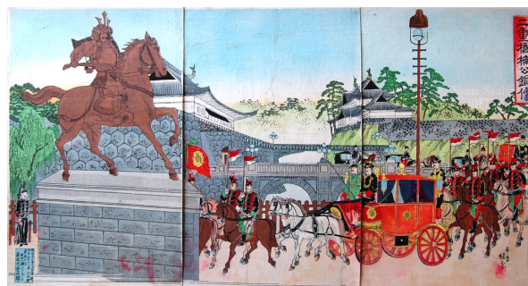
Statue of Kusunoki Masashige in front of the imperial palace, Tokyo (woodblock print, 1899, © Sven Saaler).

The site originally chosen for Saigō's statue was eventually occupied by the figure of a “true” loyalist to the imperial court – medieval warrior Kusunoki Masashige (1294-1336). Kusunoki's statue, however, was narrowly beaten in the race to become Japan's first equestrian statue by that of another feudal lord, the daimyo of Chōshū feudal domain, Mōri Takachika (aka Yoshichika, posthumous name Tadamasa, 1819-1871; see below). The Mōri statue was unveiled on 15 April 1900, while the Kusunoki statue was placed on its pedestal in May of the same year and unveiled in July. 3