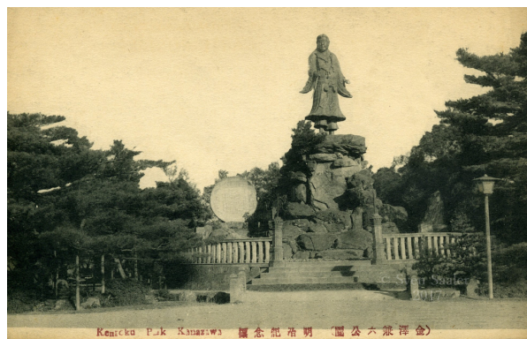
Statue of Yamato Takeru in Kenrokuen, Kanazawa (prewar postcard,).

The plans for Yamato’s statue were initiated by the prefectural governor and the commander of the Imperial Japanese Army forces stationed in Kanazawa – the representatives of the central state in this important regional city. 4 The statue was linked to plans to build a memorial to commemorate 400 soldiers from Kanazawa who had been sent to suppress the Satsuma Rebellion in 1877 and had lost their lives during their mission. It was put up in Kenrokuen – the former garden of the daimyo’s castle, which became one of Japan’s first public parks in 1874.