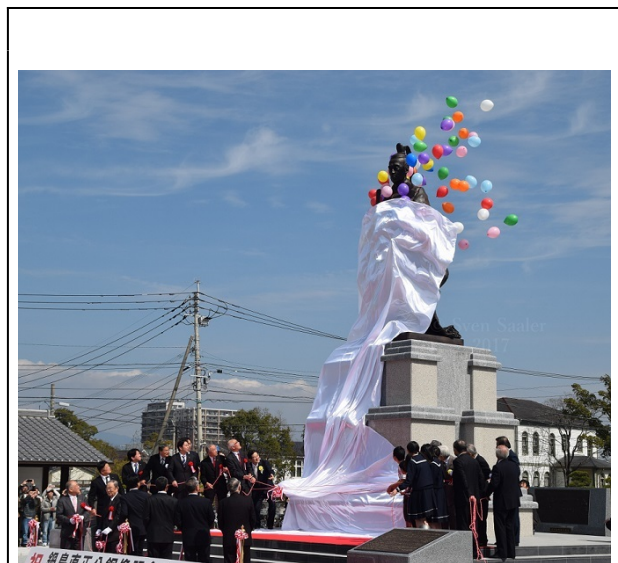
Unveiling ceremony for the statue of Nabeshima Naomasa in Saga, 2017.

Hikone, the capital of his former feudal domain, were demolished and melted down in 1944. However, given that he was instrumental in signing the first treaty between Japan and a foreign country – the United States, the leading power in the postwar occupation of Japan – the city of Hikone decided to erect a new statue of Ii. Completed in 1949, it was one of the first prewar statues to be reinstated. According to the inscription, it was erected as a memorial to a "pioneer of Japanese-American friendship," emphasizing the legitimacy of Ii's decision to open the country in the 1850s and signing a treaty with the U.S. Ii's statue in Yokohama was rebuilt five years later, in 1954, and many statues of feudal lords that had been sacrificed to the war effort followed suit. The latest addition is a figure of the last daimyo of Saga domain, Nabeshima Naomasa (1814-1871), unveiled in March 2017.