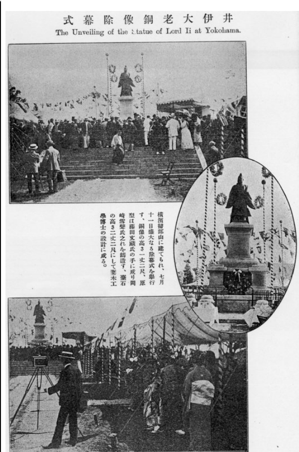
Coverage of the unveiling ceremony of the statue of shogunate regent Ii Naosuke in Yokohama, 1909 in the journal Taiyō .

not well received by the representatives of the government – the supporters of the former anti-Tokugawa movement, which Ii had so harshly repressed in the late 1850s. It would only be in 1909 that a statue of Ii became a reality, and it had to be erected in Yokohama rather than in Tokyo, as originally planned. The background to Yokohama as the site for the statue was Ii's 1854 decision to open Japan to relations with Western countries, which had led to the opening of Yokohama as a treaty port. The statue was erected to commemorate the 50th anniversary of the birth of that city. The inauguration festivities indicated that by 1909 the historical assessment of Ii had changed, even among the cliques dominating the government. Elder statesman and founder of Waseda University Ōkuma Shigenobu (1838-1922) gave a speech at the inauguration ceremony and emphasized that far from being an "enemy of the court," Ii's decision to open the country to foreign contact was that of a true patriot, an action that had saved Japan from the fate of colonization.