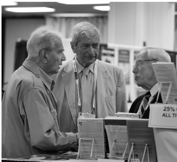
The Exhibit Hall featured vendors from one hundred of the top publishers in the discipline.