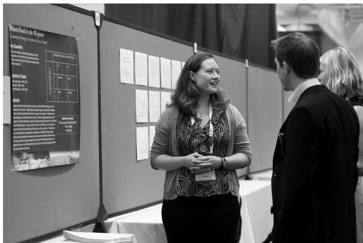
Many posters were presented in the Exhibit Hall of the Marriott Wardman Park.