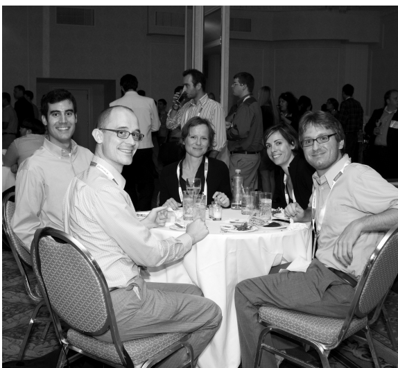
Graduate students mingled and enjoyed themselves at the graduate student happy hour.