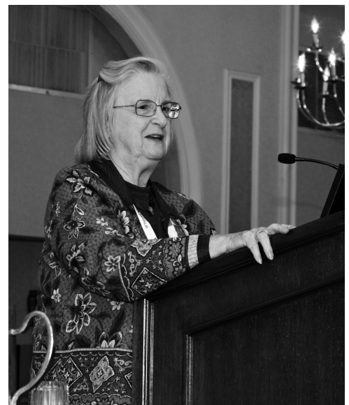
Nobel Prize winner Elinor Ostrom delivered a plenary address entitled “Addressing the Theory of Collective Action from a Multiple Methods Perspective.”