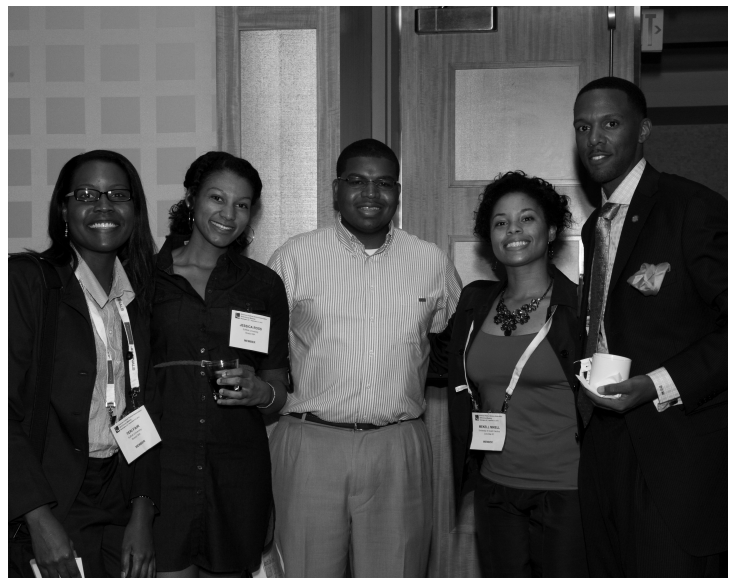
The Committee on the Status of Blacks in the Profession held a reception Friday evening.