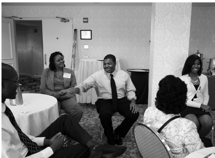
A group of scholars from the Ralph Bunche Summer Institute shared their experiences at a coffee hour.