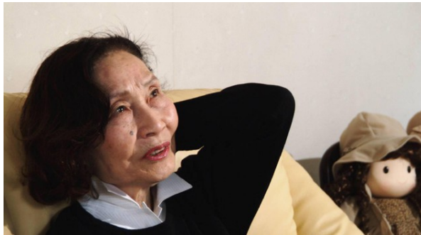
Hayashi Kyoko.

This story was first published in the February 1976 issue of the literary magazine Gunzō and later anthologized in the Collected Works of Hayashi Kyōko (Hayashi Kyōko zenshū) (Tokyo: Nihon tosho sentā, 2005). The original title, Nanja monja no men , draws on the Kantō area dialectal expression “ nanja monja ,” a contracted form of “ najō iu mono ja ” (What sort of thing is this?), referring to a large, legendary tree.