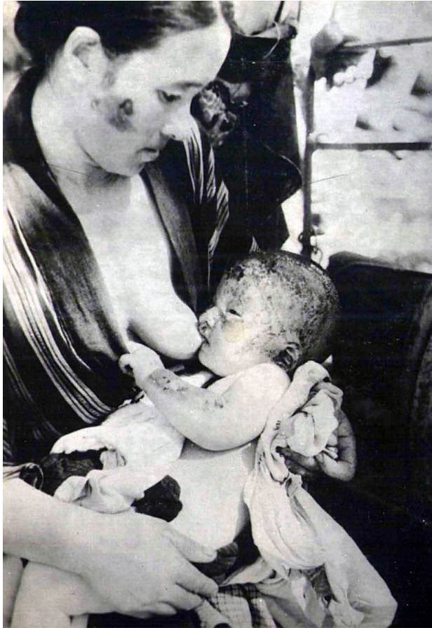
Hibakusha mothers and children

As usual, he listened while reading, then asked, his eyes rounded, "Can you be with child?" He added: "More importantly, I am surprised that you intend to give birth. In the first place, you are a hibakusha . Second, you are the one who explained to me how radiation would affect the genes."