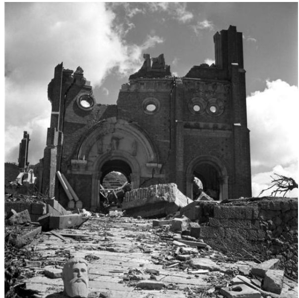
Urakami Cathedral, Nagasaki, damaged by the atomic bomb.

This story was first published in the February 1976 issue of the literary magazine Gunzō and later anthologized in the Collected Works of Hayashi Kyōko (Hayashi Kyōko zenshū) (Tokyo: Nihon tosho sentā, 2005). The original title, Nanja monja no men , draws on the Kantō area dialectal expression “ nanja monja ,” a contracted form of “ najō iu mono ja ” (What sort of thing is this?), referring to a large, legendary tree.