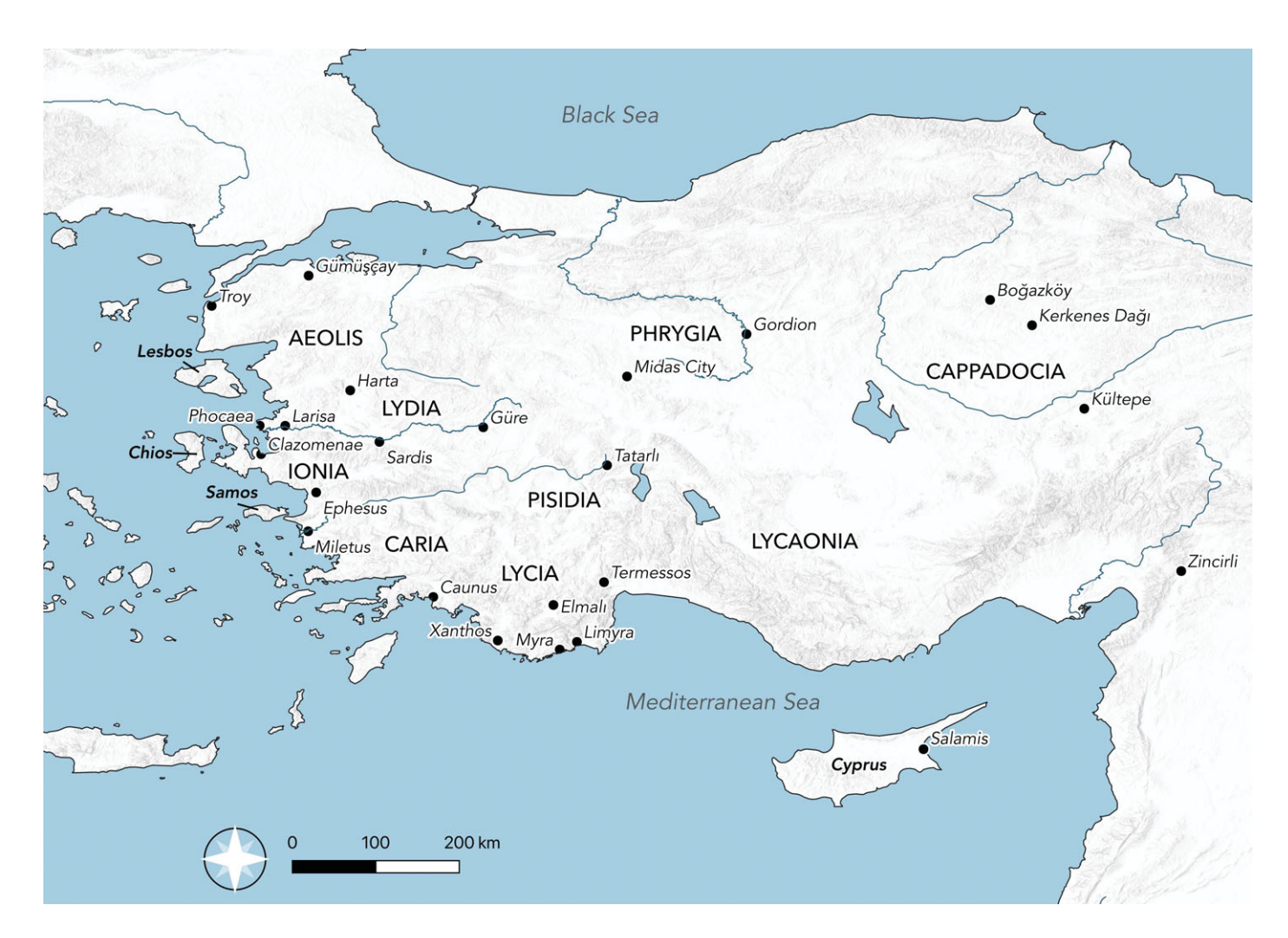
Map 3 Anatolia and nearby islands, with sites and regions mentioned in the text