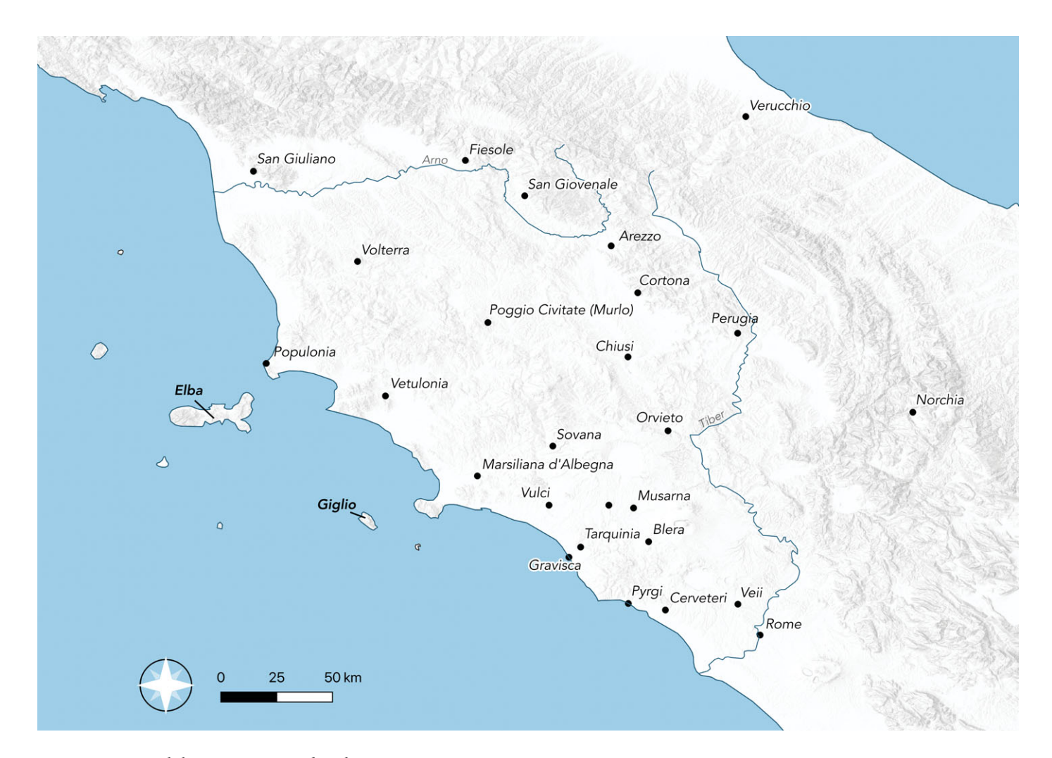
Map 2 Etruria, with key sites mentioned in the text