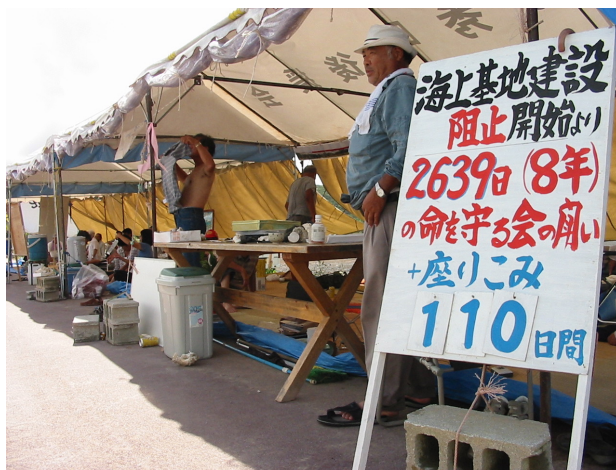
Day 110 of the Henoko anti-base struggle

In this situation, anything could happen, even an act of terror. Faced with an opponent who monopolizes the means of violence to such an unequal degree, it is understandable that the people insist on the right to possess means of resistance and to use them. I would not be surprised if acts of resistance were to occur tomorrow, in Nagatacho, Ichigaya, Kasumigaseki, or Okinawa. The present Agreement is not a prescription for dealing with "newly emerging threats," but a device to stir up such threats.