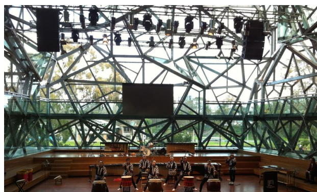
Figure 5: Poster for "Hiroshima and Nagasaki Peace Concert 2013". 31