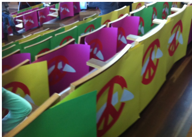
Figure 7: Japanese for Peace Logo. 32