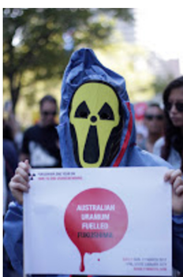
Figure 2: Photograph of Demonstrator at Commemorative Event in Melbourne, March 2012. 21

Children milled about, offering masks to the assembled crowd. The masks were yellow and black, a hybrid image combining the international sign denoting nuclear radiation and a face that mimicked Edvard Munch's (1863-1944) painting of 1893, "The Scream". 20 Variations on this black-and-yellow sign for radiation also featured in demonstrations in other parts of the world. These graphic symbols were originally designed to warn of the danger of radioactivity in a way that transcended particular languages. In their adaptations, the new versions of the symbol have helped to forge a visual vocabulary of transnational activism. One demonstrator was dressed as a giant sunflower, the symbol of solar power - an alternative to nuclear energy and fossil fuels. Some children were dressed in red "oni" (devil) costumes symbolising the evil of nuclear power. A few carried origami cranes.