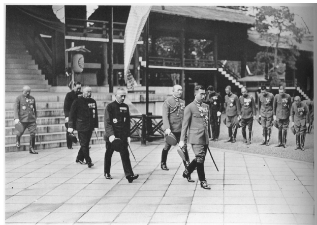
Hirohito at Yasukuni Shrine in 1935