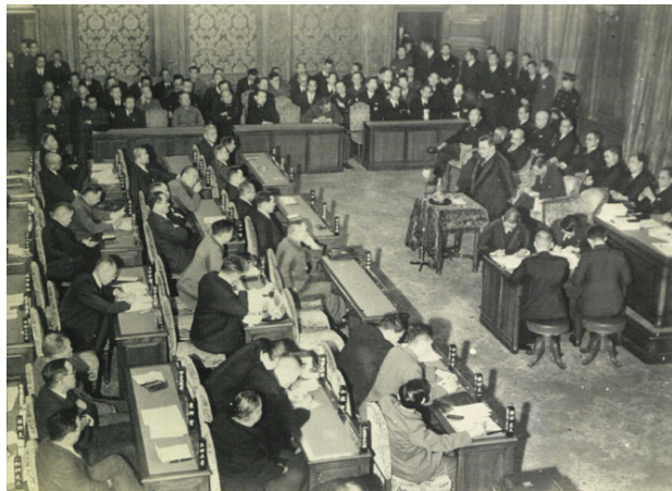
Finance Minister Kaya Okinori addresses Diet Budget Committee, 1944

Japanese critiques of the Pacific War have not been limited to pacifists and progressives. Kaya Okinori (1889-1977), who led the War Bereaved Families Association (Nihon Izokukai), for fifteen years beginning in 1962, was finance minister in the wartime Tojo cabinet. The Association is a powerful political bulwark and lobby for Yasukuni Shrine, and, indeed for the Liberal Democratic Party, which in turn continues to support family members of deceased soldiers financially six decades after the war. Kaya served ten years of a life sentence imposed by the Tokyo Tribunal before being released and eventually taking up a post as Justice Minister. In his memoirs, Kaya condemned Japan's war against the US and criticized his own role in the war. His most important point, no less pertinent today than when he wrote, is this: "as a Japanese, it is extremely regrettable that the people themselves could not judge the responsibility of their leaders." [18]