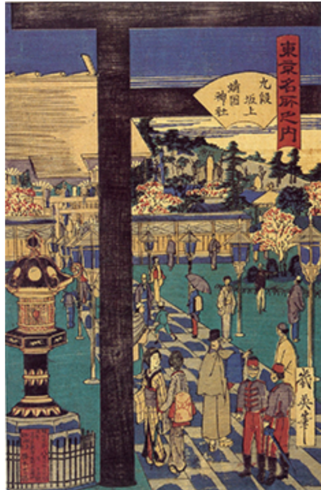
Yasukuni Shrine in a Meiji woodblock

Yasukuni Jinja both is and is not a “Japanese” problem. As a Shinto shrine with enduring historical links to the emperor—established in 1869 “to commemorate and honor the achievement of those who dedicated their precious life for their country”—and with a deep association with every Japanese war from the Meiji era through the Asia Pacific War, it evokes Japanese tradition linking Shinto, emperor and war. [1] Yet to see it simply as Japanese is to neglect a range of features characteristic of contemporary nationalisms. This view ignores important regional and global forces, particularly the role of the United States, in shaping politics and ideology from the Japanese occupation to today.