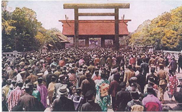
A festive crowd throngs the shrine in 1940

Another kind of alchemy goes hand in hand with the alchemy of exaltation. This is the alchemy of amnesia . . . forgetting atrocities and war crimes, forgetting the treatment of the military comfort women, of forced laborers, of those whose lands were invaded, homes destroyed and families slaughtered in the name of emperor and empire. While the military dead were enshrined as kami at Yasukuni shrine and their families received state pensions, the hundreds of thousands of civilian dead and many more injured were forgotten: neither shrine nor state commemorated their sacrifice or attended to the needs of their families. If nationalism has everything to do with invented tradition, as Benedict Anderson has compellingly argued, it is equally about suppressed or forgotten traditions.