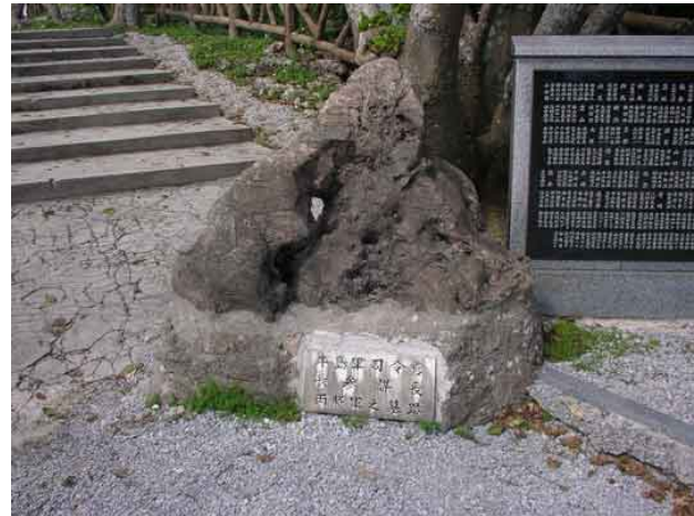
Memorial to Ushijima and Cho

The Japanese government, displaced from Okinawa by US forces, worked to lay claim not only to the souls of mainland Japanese soldiers who died, but also to those of Okinawan soldiers and even civilians. USCAR documents record the fact that in January 1964 “the Japanese cabinet decided to confer court ranks and decorations posthumously to World War II war dead, including approximately 52,700 Ryukyuan (Okinawans).” [10]