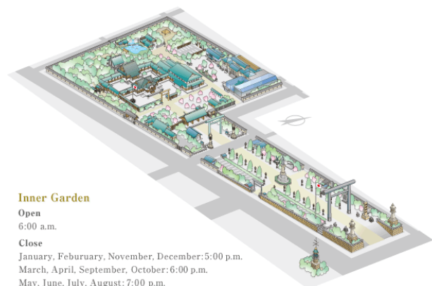
Yasukuni shrine layout today