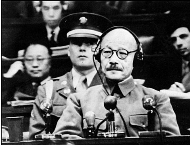
Tojo at the Tokyo Trial

During the occupation, while shorn of official ties to the state and given a ‘private’ religious status, Yasukuni Shrine remained the central national-religious symbol for those who would defend the memory of war and would deny calls from Chinese, Koreans and other victims, including GI prisoners of war, for apologies and compensation for Japanese war crimes and atrocities. [15]