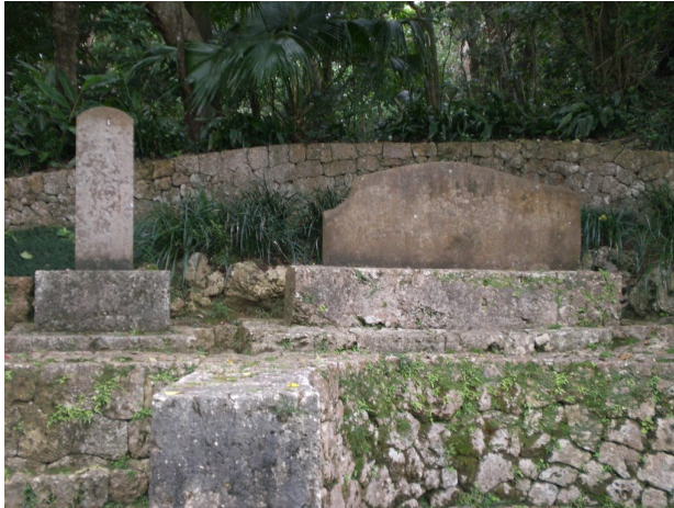
Monuments at Shikina

If Konpaku was the creation of Okinawan villagers, Shikina was primarily the product of GRI (that is, the US administration of the Ryukyu Islands) under pressure from Tokyo. Yet we cannot simply conclude that Konpaku embodied Okinawan sentiment while Shikina was the expression of Tokyo and/or the US. Both sites honored the military and the civilian dead, Japanese and Okinawan, although as we will note, with quite different emphases.