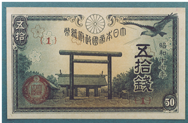
Shrine on 50 sen bill, 1943.

Another kind of alchemy goes hand in hand with the alchemy of exaltation. This is the alchemy of amnesia . . . forgetting atrocities and war crimes, forgetting the treatment of the military comfort women, of forced laborers, of those whose lands were invaded, homes destroyed and families slaughtered in the name of emperor and empire. While the military dead were enshrined as kami at Yasukuni shrine and their families received state pensions, the hundreds of thousands of civilian dead and many more injured were forgotten: neither shrine nor state commemorated their sacrifice or attended to the needs of their families. If nationalism has everything to do with invented tradition, as Benedict Anderson has compellingly argued, it is equally about suppressed or forgotten traditions.