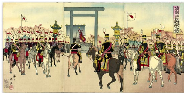
Yasukuni Shrine festival 1895. Woodblock print by Shinohara Kiyooki. Reproduced from

Yasukuni is, of course, quintessentially Japanese in its mix of Shinto and emperor lore, its architecture and rituals that apotheosize the military war dead as kami (deities), and its nationalist perspective on colonialism and war, emperor, and the souls enshrined there.