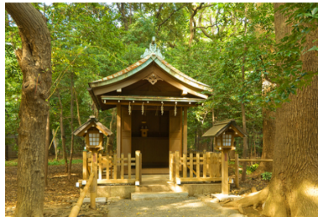
Chinrei-sha, Spirit-pacifying shrine

compact to secure the compliance of soldiers and civilians to fight and die for goals proclaimed by the state. [4] If the symbolism of Yasukuni is distinctive in its particulars, it is but one such manifestation of a global phenomenon of state-sponsored war nationalism pivoting on the military war dead. With the enshrinement of Japan's 2.46 million military dead, the senbotsusha , that is, all who died in uniform from Meiji through the Pacific War (2.1 million in the Pacific War), Yasukuni reinforced its position as the central symbol linking emperor, war, the military and empire. John Breen's sensitive analysis of the shrine's rites of apotheosis and propitiation well documents the nexus of power and ideology that gives the shrine its special place in contemporary Japan. [5]