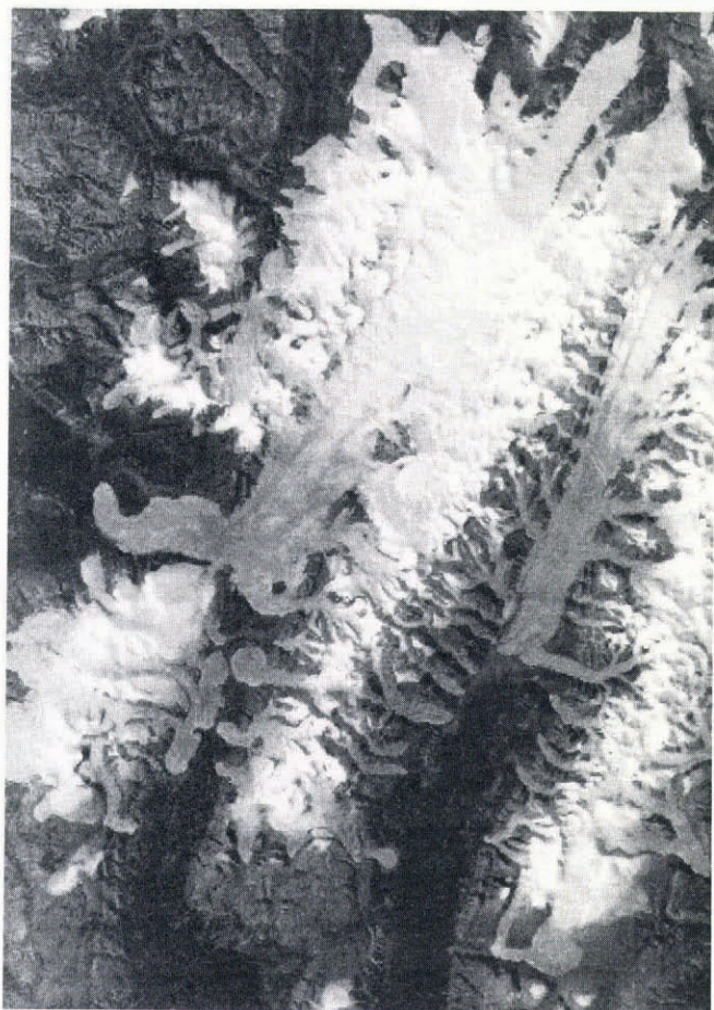
Fig.1. A grey-tone print of part of the Steacie Ice Cap. The Good Friday Bay Glacier, a tidal, outlet glacier, can be seen, left, where it terminates in a fjord. The width of the area shown is approximately 60 km.