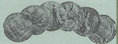
Gold Medal (Highest Award), Allahabad 1910.

GRANDS PRIX: Paris 1900, Brussels 1910, Buenos Aires 1910.