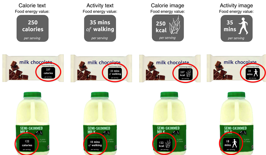
Fig. 2 (colour online) Labels used as stimuli combining the experimental conditions of energy representation (activity/calorie) and format (image/text).

Participants estimated how many calories they were required to consume in a day and how much walking time this amount would confer. This allowed us to control for participants' existing knowledge about recommended calorie amounts. On average, participants gave fairly accurate estimates of what their total calorie intake should be (mean 1787 (SD 1368) kcal/d), but underestimated the time needed to walk this amount off (mean 156 (SD 341) min). To control for experience with food labels, participants also indicated on a 7-point Likert scale (1 = 'strongly disagree, 7 = 'strongly agree') whether they agreed with