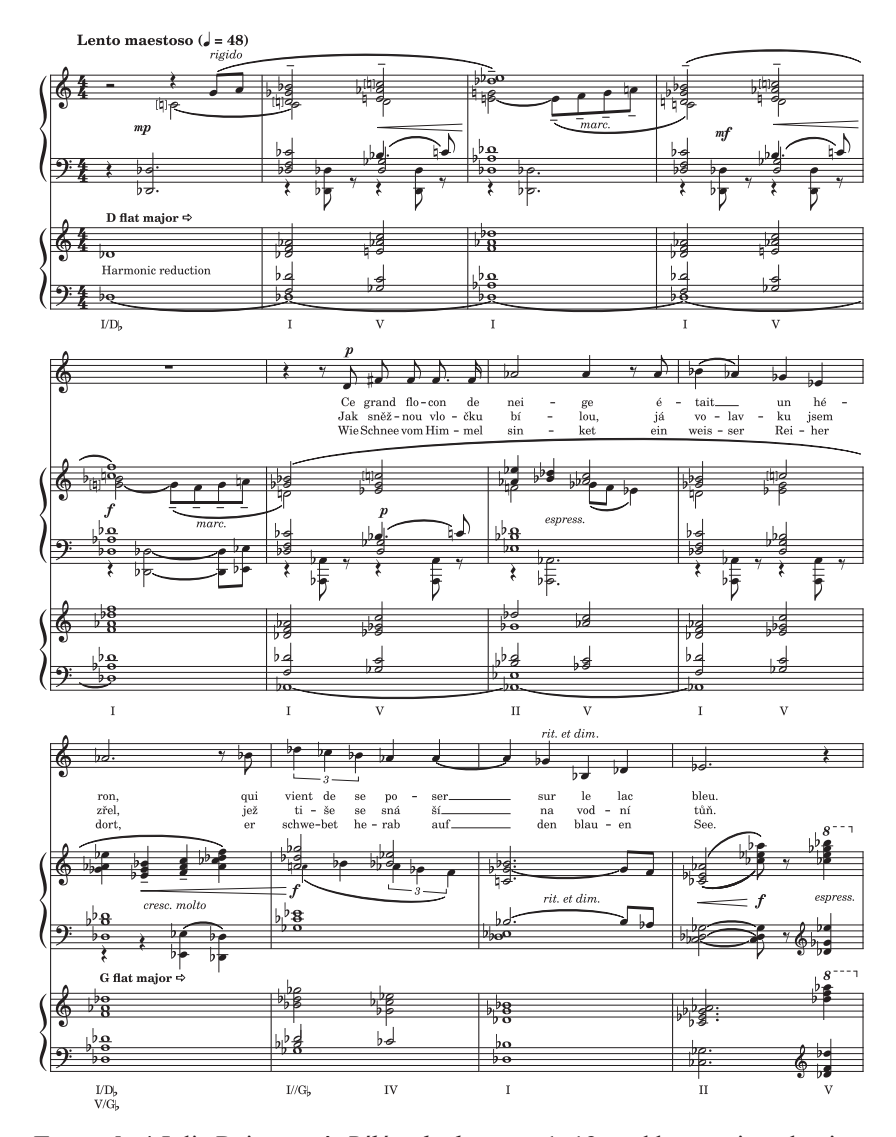
Example 4 Julie Reisserová, Bílá volavka, mm. 1–12, and harmonic reduction.

key ( Pastorale maritimo , Slavnostní den ), on the dominant chord ( Příznivá bouřka ), or even one second apart ( Za svítání : E flat minor/D minor). The last chord may include an added fourth ( Za svítání ), be a minor ninth chord without the third ( Vzpomínka : c-g-bb-db), or a stacking of fourths ( Nostalgie : g-c-f-bb).