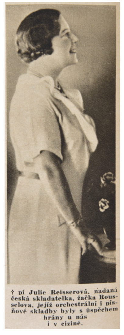
Figure 4 "Mrs. Julie Reisserová, a gifted Czech composer, a pupil of Roussel, whose [Reisserová's] orchestral and vocal compositions were successfully performed here and abroad."

call-number: 54 A 2313. Originally published in Forum (February 29, 1936), 19; L'Art musical (January 22, 1937), [378]; Le Guide du Concert (February 12, 1937), 515; Neues Wiener Journal (April 20, 1937), 7; Pestrý týden (March 12, 1938), 2.