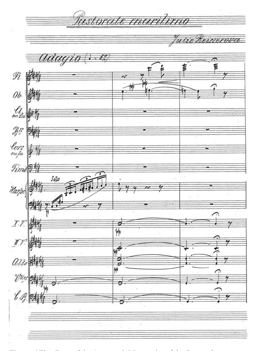
Figure 6 First Page of the Autograph Manuscript of the Pastorale maritimo . Image Courtesy of the Library of the Conservatoire régional du Grand-Nancy; no call-number.