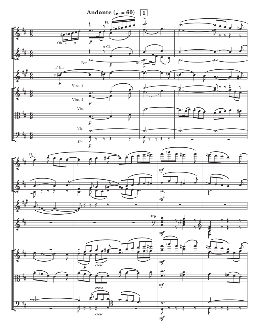
Example 5 Julie Reisserová, Pastorale maritimo, mm. 8–17.

first part (Allegro impetuoso, mm. 1–47), the circular sixteenth-note ostinato depicts the "bad and nasty wind" ("le mauvais et méchant vent") that keeps the lover awake; in the second part (Andante amoroso, mm. 48–75), the vehement ostinato gives way to a still circular motif, but this time gentle, to emphasize the arrival of the beloved and the narrator's growing desire. Similarly, and as shown in Example 4, the dark and morbid mood absent from the poem ( Bilá volavka ) is only suggested by the piano. As for Nostalgie , it must be singled out for its