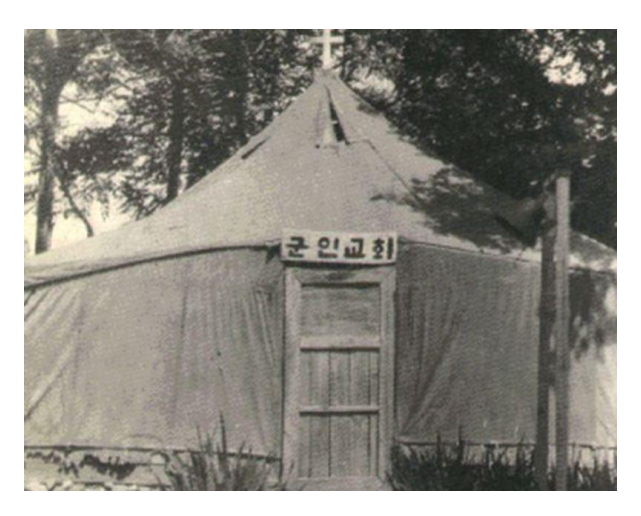
A field church in the South Korean army, the early 1950s.