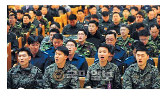
A prayer meeting of the Protestant military