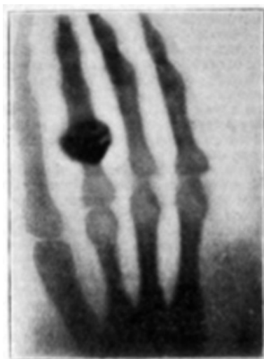
Figure 1 X-Ray image from Röntgen (1896, 276)

Röntgen's (or similar) experimentation will rest upon evidence gleaned from visual perceptual experience. Only the most skeptical of opponents would gainsay. (I am not claiming that we visually perceive X-rays.)