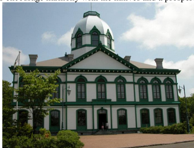
Hokkaidō colonial headquarters, Sapporo

Hokkaidō is the most important place for the Northern Gate of the Empire. With regard to the proclaimed development, sincerely carry out the Imperial Will, and make efforts to spread welfare, education and morals with kindness. With the gradual immigration of mainlanders, make sincere efforts to encourage harmony with the natives and a prosperous livelihood. [3]