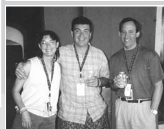
CME in the Sun