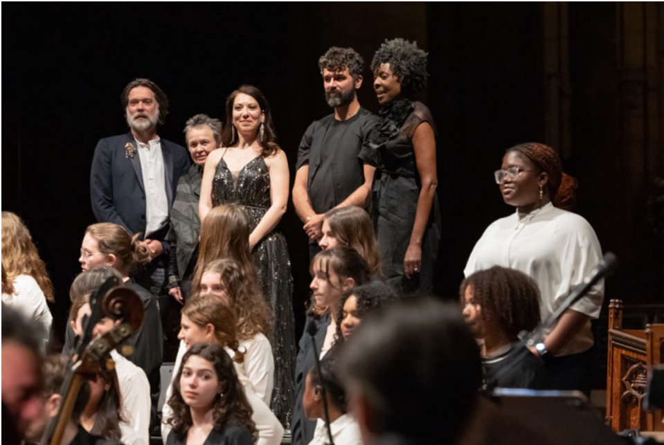
Fig. 4 Waiting for the Barbarians Concert, Archive of Desire Festival in New York