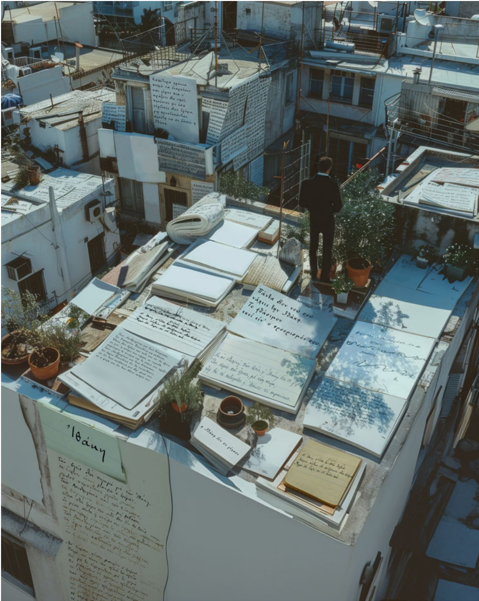
Fig. 3 Cavafy manuscripts on rooftops, Athens Surreal for the Onassis Foundation

archive, and related educational and cultural activities, engaging with other popular accounts as well. For instance, the @CCavafy handle on X, which shares images of Cavafy's manuscripts to its 14.1K followers, is 'followed' by the Onassis Stegi.