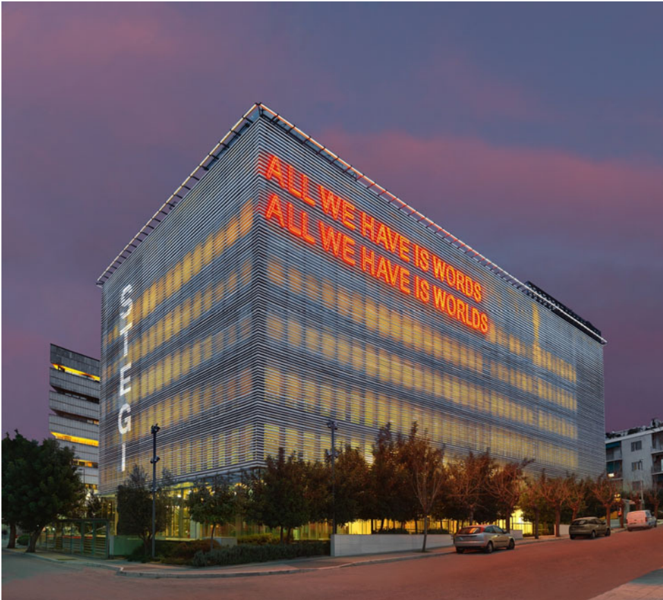
Fig. 2 Onassis Stegi Building