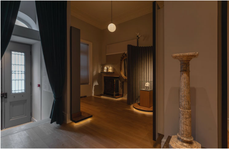
Fig. 1. Cavafy Archive, Frynichou Street 16B, Plaka, Athens.

creating a ‘tailor-made space’ that would ‘reflect the ambience’ of the poet’s home in Alexandria; 10 a velvet curtain at the entrance welcomes visitors into an intimate setting where Cavafy’s belongings or replicas of those are neatly displayed (Fig. 1). Shortly after the opening, a special edition of the Athenian newspaper Lifo and a brochure by the Archive, both available in print and digital formats, delved into every aspect of the archive’s design: its curation principles, architectural vision, spatial configuration, and even its lighting. These publications consistently emphasized the archive’s transnational openness and accessibility, signalling that Cavafy’s legacy merits the attention of general audiences. Nonetheless, access to the original manuscripts of the archive remained somewhat controlled. Scholars may consult Cavafy’s originals in the Reading Room, located at the far end of the archival home, only if they demonstrate that the accessible digital copies do not fulfil their specific research needs. These restrictions complicate the status of the originals, which are both deemed no longer essential for in-person consultation due to digitization and preserved as valuable artefacts, diligently safeguarded against material decay.