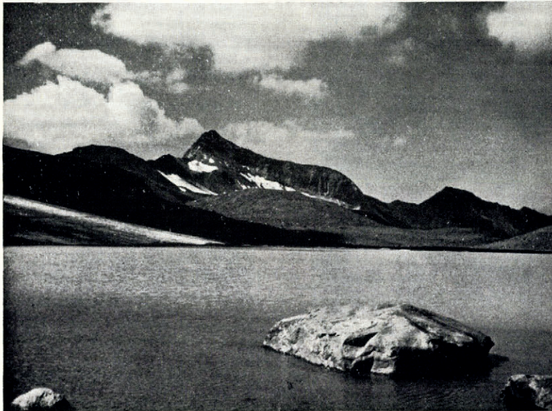
Recession of the Glacier du Valtournanche