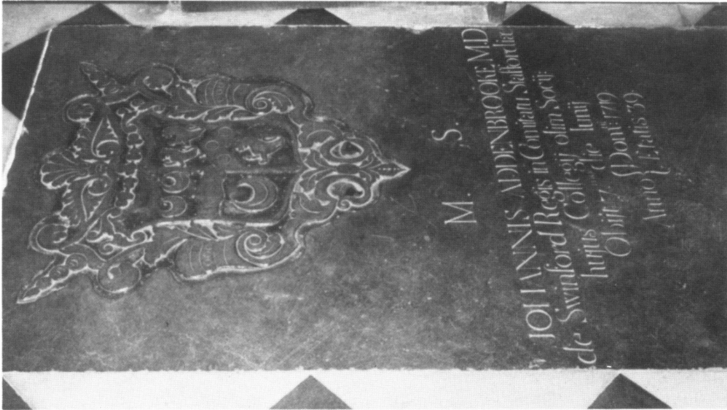
Figure 1. The tomb of John Addenbrooke in the Chapel of St. Catharine's College, Cambridge.