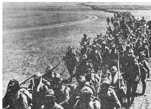
Japanese soldiers on the march, 1939.

on foot, and the primary mode of transportation for artillerymen and machine gun squadrons within infantry regiments was not car but horse. Even the transport corps, which was tasked with supplying food and ammunition, depended largely on transportation by horseback and horse-drawn carriage. When it came to movement and transport, the Japanese Army relied heavily on its foot soldiers and horses.