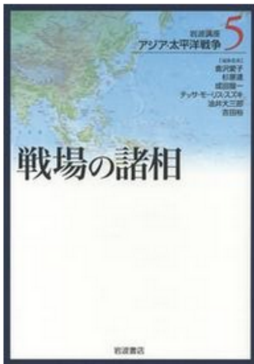
The edited volume containing Yoshida's article, published by Iwanami Shoten

Ajia-Taiheiyō sensō 5: senjō no shosō (2006)