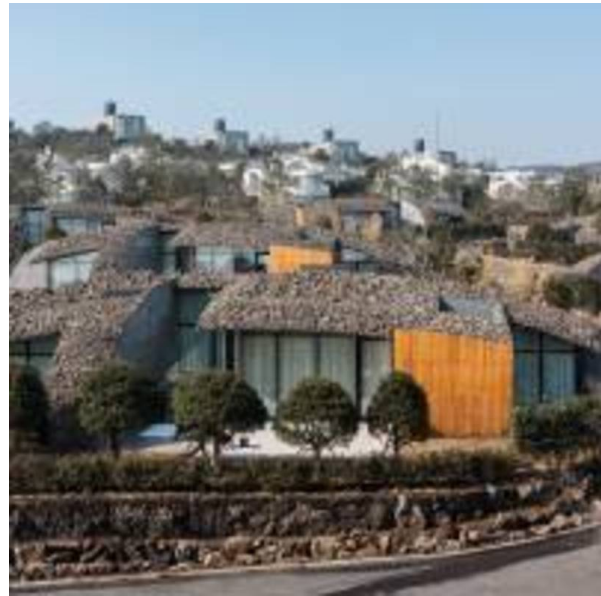
Jeju Ball Hotel

There is a porousness in Kuma's structures that enhances the qualities of his materials. This is even true of some stone in his work. He laid volcanic rubble over the low sloping roofs of the buildings of the Jeju Ball hotel on South Korea's largest island of Jeju. (The island boasts more than 300 lava cones.) The roofs and the ground are linked in texture, and light from skylights scatters shadows. There is a randomness to the way the light falls and fragments. The connection here, between the natural and the artificial, is produced in the eye of the beholder.