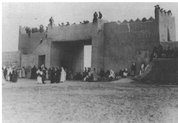
City Gate. Kuwait, 1928.

Until recently the IDC collection on the Middle East could only be consulted from numerous subject catalogues.