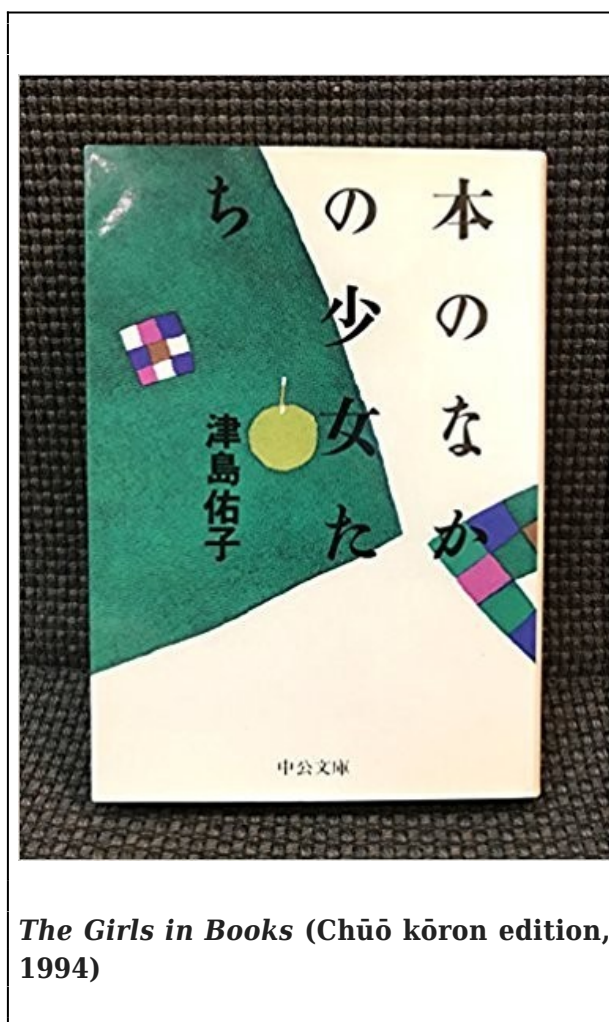
The Girls in Books (Chūō kōron edition, 1994)

Tsushima Yūko is a writer's writer—someone with intimate knowledge of written prose, poetry and song from the classical period to the present. She is also someone whose choice of genres and modes changed in topic and style over the course of her life, as it came into