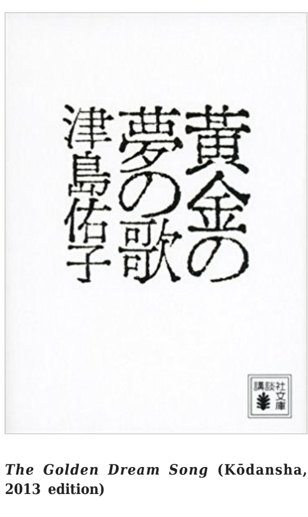
The Golden Dream Song (Kōdansha, 2013 edition)

Tsushima’s interest in narrative forms from and about Japanese geo-peripheries, especially displaced, orphaned ones, extends to aboriginal and oral cultures around the world. Some of these cultures, as archived in writing and song, demonstrate kinds of autonomy that became a collectively-linked site for exploring a different mode of what we have come to call “world literature.”