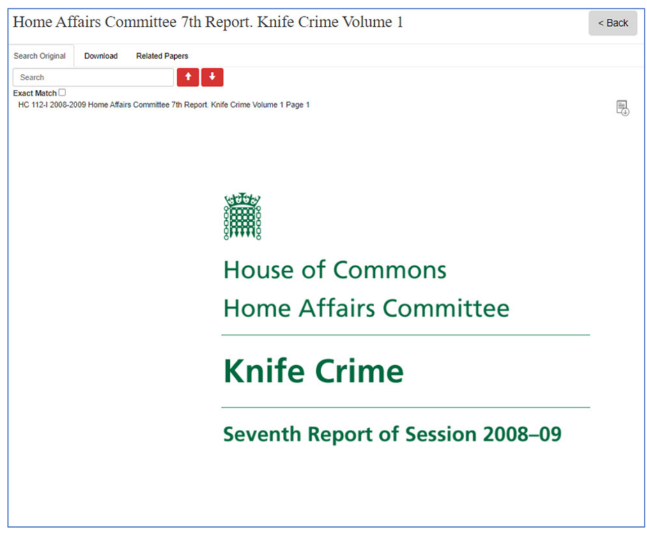
Figure 4: Search results-browsing the document