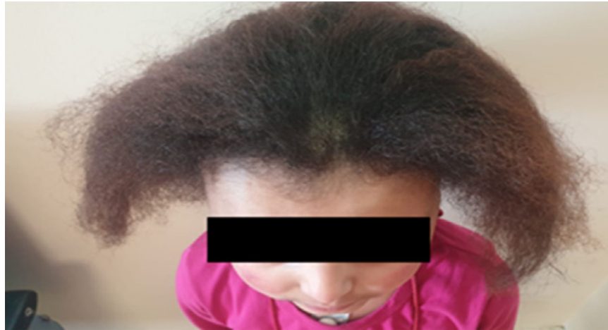
Figure 1. Woolly hair of the patient.