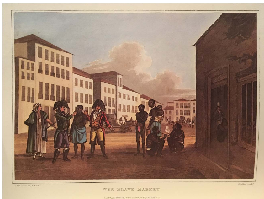
Figure 2. This plate, entitled “Slave Market” was originally painted by the British officer Henry Chamberlain (1796–1843), who visited Rio de Janeiro in 1819 and 1820. It depicts the surroundings of the Valongo, the famous docks where the Africans who survived the Middle Passage were sold in the markets as slaves. Around the commercial area of the Valongo and Rio’s waterfront, many of the stories discussed in this article unfolded. Chamberlain’s description reads: “The Plate represents an elderly Brazilian examining the Teeth of a Negress previous to purchase, whilst the Dealer, a Cigano, is vehemently exercising his oratory in praise of her perfections. The Woman looking on is the Purchaser’s Servant Maid, who is most frequently consulted on such occasions.”

Views and Costumes of the City and Neighbourhood of Rio de Janeiro, Brazil, from Drawings taken by Lieutenant Chamberlain, Royal Artillery, during the years 1819 and 1820, with descriptive explanations (London, 1822).