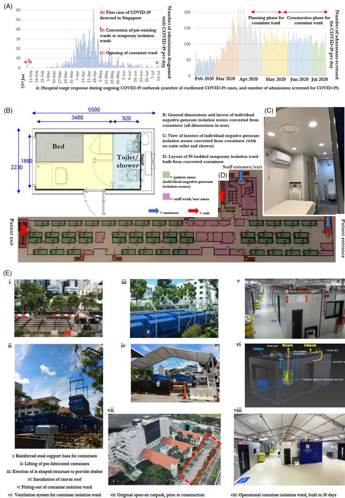
Fig. 1. Hospital surge response over 6 months during COVID-19 outbreak, layout of container isolation ward, and construction process.

community-based measures to reduce transmission. 6 During construction, the prefabricated containers were placed on a reinforced base. Over the containers, an A-shaped structure with a canvas roof was erected to provide shelter. Nurses' stations, a rest