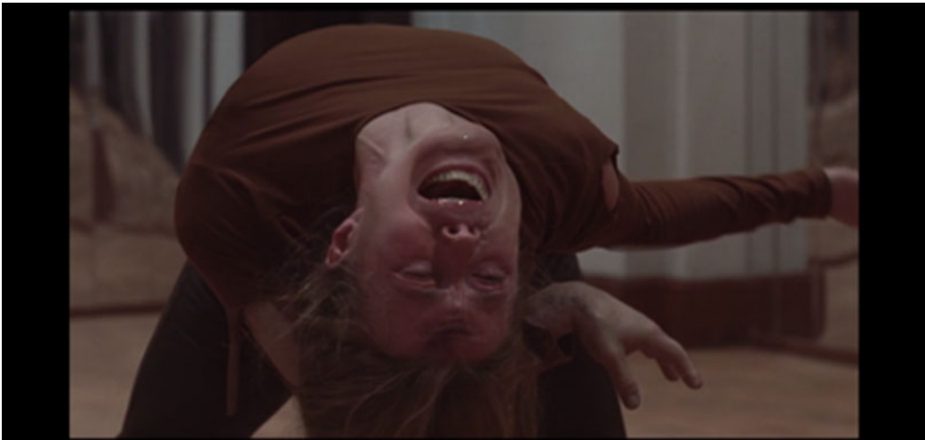
Photo 8. Olga's spectacularly mangled body. Luca Guadagnino, Suspiria 2018.

total of 201 individual shots, with an average shot length of 1.03 seconds” (2022, 81). Such a dance could never be viewed staged, which elevates this screendance as an appropriate mode of representation.