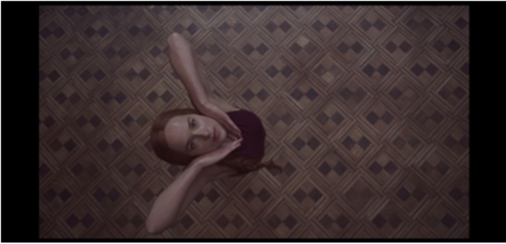
Photo 6. Triangular and bewitching pose to begin the destructive dance. Luca Guadagnino, Suspiria (2018).

right side, with deep exhalation, sends Olga flying into the paneled mirror. Chainés into a forward lunge and exhalation thrust Olga into an arched back position. Susie holds on and pulls, forcing Olga to perform a spectacular barrel turn in the air and to the ground. Susie's sudden and angular hand and wrist movements crack Olga's body parts. Throughout the crosscutting of Jalet's two dances, shots of Blanc's, Miss Tanner's, and the students' reactions are interspersed, showing increasing interest. Sensing the intense effects of her dancing, Blanc tells Miss Marks, who controls the music, "Lauter!" and Miss Tanner emphatically and breathily whispers, "Bravo, Susie." Both teachers are filmed with a zoom medium shot to increase intensity throughout the dance, and it is clear that they know full well that as Susie demonstrates her enhanced prowess, it also results in Olga's torturous demise. Blanc revels in the combining of their powers to create a terrorist spectacle like the RAF but with even more visual revulsion. The increasing number of fast crosscuts resemble Susie's angular and abrupt gestures as well as the paneled mirror, which ever more clearly represent the fragmented nature of Olga's body. Kaixuan Yao argues that the film operates using an "active form" of ventriloquism through spells (2022, 122). We see this particularly when Blanc combines her power with Susie's; she uses the young dancer's body as a vessel to mangle Olga's body.