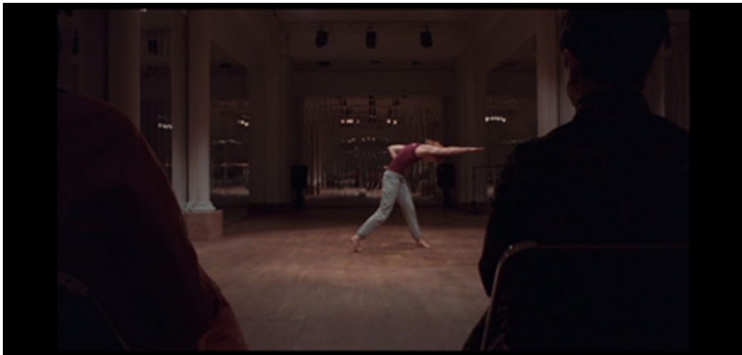
Photo 1. During Susie's audition as she carves out space to her left and lets out an audible breath. Luca Guadagnino, Suspiria (2018).