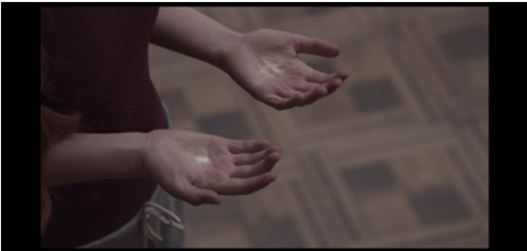
Photo 5. Visual sign of power transference from Blanc to Susie. Luca Guadagnino, Suspiria (2018).

witches cast a spell on her. Instead of walking to the school's entrance to leave, Olga stumbles to the bottom of the stairs toward the mirror studio, where Susie auditioned. Hearing the disembodied, omniscient voice of Miss Tanner calling her, Olga drops her suitcase and trench coat, and enters; the door closes behind her as if by magic, and she is trapped.