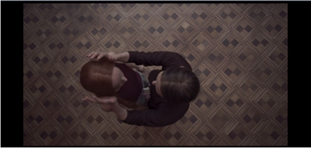
Photo 4. Similar hair parts for Susie and Blanc along with geometric brown parquet. Luca Guadagnino, Suspiria (2018).