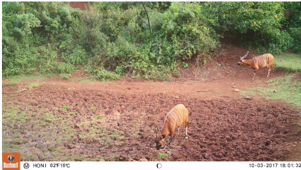
PLATE 1 The mountain bongo Tragelaphus eurycerus isaaci recorded by a camera trap at a salt lick in the Salient area of Aberdare National Park, Kenya. The Bongo Surveillance Project places cameras at active salt licks to maximize encounter probability.

has relied on surveillance monitoring. A local NGO, the Bongo Surveillance Project, has conducted camera trapping to confirm presence at known locations of occurrence since the early 2000s (Prettejohn, 2004, 2008; Plate 1). Although this surveillance has been essential in confirming continued bongo presence, more detailed information is needed to manage these subpopulations effectively.