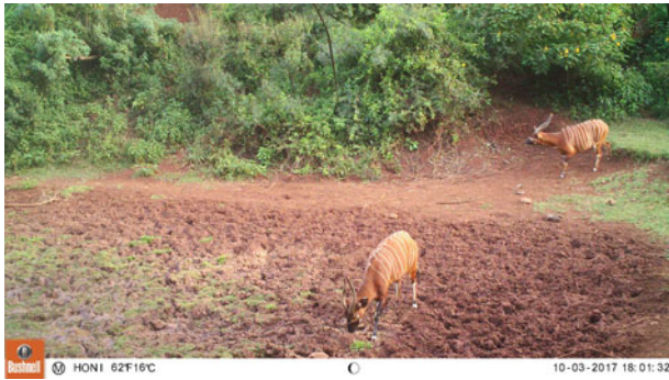
PLATE 1 The mountain bongo Tragelaphus eurycerus isaaci recorded by a camera trap at a salt lick in the Salient area of Aberdare National Park, Kenya. The Bongo Surveillance Project places cameras at active salt licks to maximize encounter probability.

has relied on surveillance monitoring. A local NGO, the Bongo Surveillance Project, has conducted camera trapping to confirm presence at known locations of occurrence since the early 2000s (Prettejohn, 2004, 2008; Plate 1). Although this surveillance has been essential in confirming continued bongo presence, more detailed information is needed to manage these subpopulations effectively.