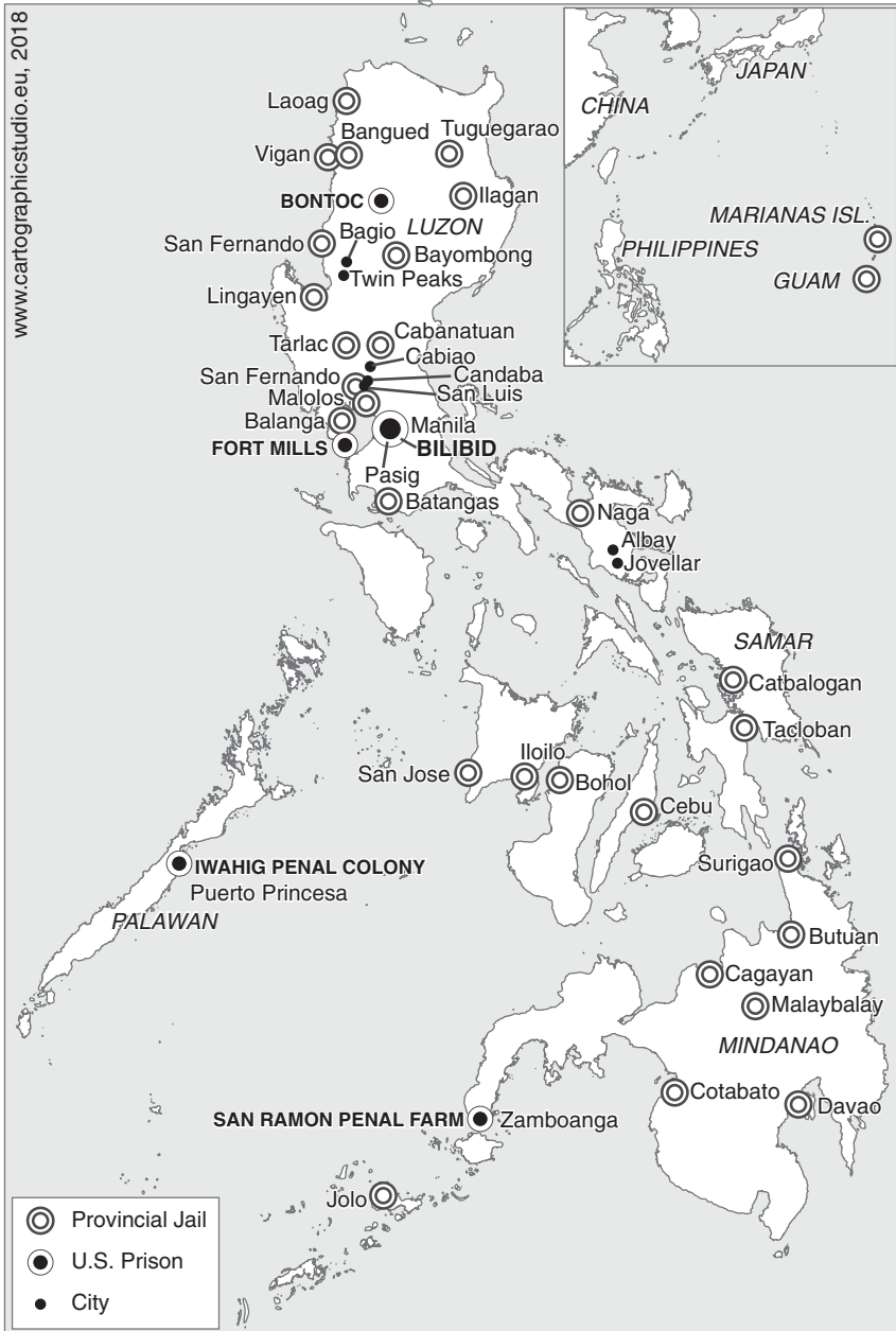
Figure 1. The US Colonial Prison System in the Philippines.