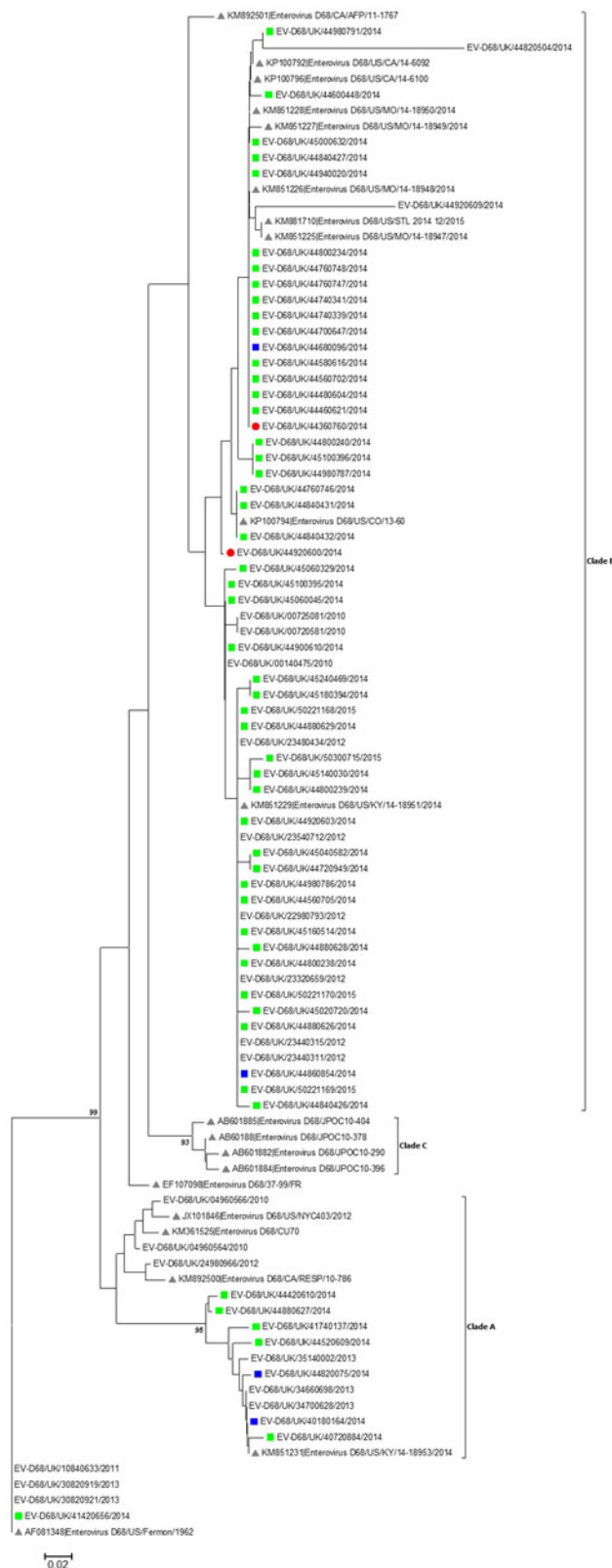
Fig. 3. Phylogenetic analysis of partial VP1 sequences of EV-D68 covering the BC and DE loops of the VP1 region. The evolutionary history was inferred using the Neighbour-Joining method and the optimal tree with the sum of branch length = 0.95104738 is shown. The percentages of replicate trees in which the associated taxa clustered together in the bootstrap test (1000 replicates) are shown next to the branches (where >90%). The tree is drawn to scale. Analyses were conducted in MEGA6 [18]. ■(green) = ESS specimens; ■(blue) = RCGP specimens; ● = Cases associated with neurological illness; ▲ = Reference sequences.