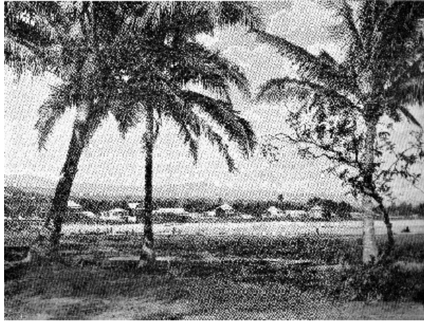
"Apia, Samoa"; the second illustration under Samoa in World of Today , Vol 4, 1907, p. 183.

narratives, it seems editors and readers were comfortable with this manner of knowing Samoa.