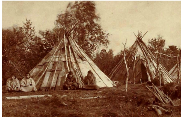
Uilta Village, early 20th century

Here is his description of the evening meal in a house in the Uilta village of Old Val, on Chaivo Bay: