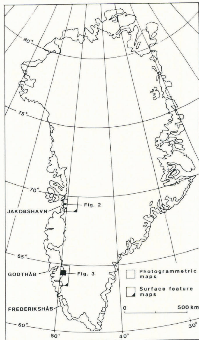
Fig.1. Location map, showing coverage of produced photogrammetric and surface feature maps. Positions of map examples given in Figure 2 and 3 are shown.

As pointed out by Blachut and Müller (1966), large-scale specialized maps are a prerequisite for most glacier investigations. In the present situation, detailed surface