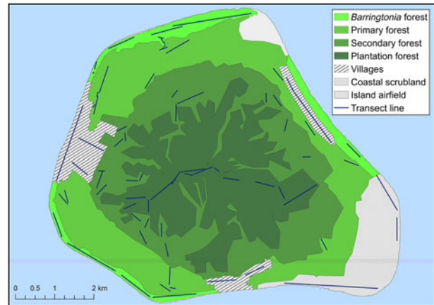
FIG. 2 Locations of the 73 transects surveyed across Mangaia during December 2018–February 2019. The area in the north-east of the island without any transects is where the airstrip is located; this was not considered a separate habitat type and was ignored for sampling purposes.

The common myna was estimated to have a population size of 13,350 individuals (95% CI 10,998–16,206; Table 1). The highest densities were in and around the villages and in the secondary forest, where the majority of individuals were found (Fig. 3). The coastal habitats supported fewer individuals than the inland habitat types, and the habitat with the lowest density of common myna was the plantation forest. The pooled CV for all habitat types was 9.8%; secondary forest had the smallest CV (11.7%) and coastal