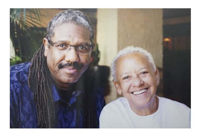
Figure 5. Neal A. Lester and Nikki Giovanni. Photo Credit: Rebecca Ross, September 2014.

cold water or a kiss."<sup>22</sup> For so many who are mourning and will continue to mourn her loss, Nikki Giovanni was indeed poetry in motion. In a slightly revised context, she was, in the lyrical sentiment of Carl Carlton in 1981, "a bad mama jama – just as fine as she could be" (Figure 5).<sup>23</sup>