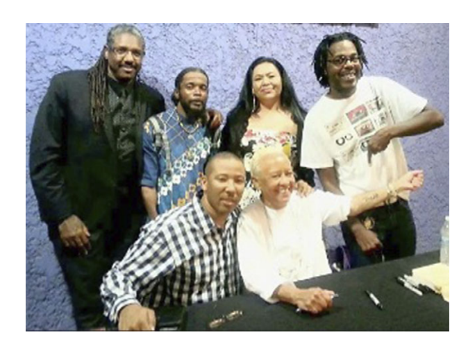
Figure 4. Event attendees posing for picture at book signing with Nikki Giovanni and Neal A. Lester as Giovanni shows her "Thug Life" lower arm tattoo. Mesa Arts Center (Mesa, AZ), 13 February 2014.

of the millennial Black attendees elevated her already high street cred when she proudly displayed and talked about her Tupac 'Thug Life' tattoo (Figure 4).<sup>10</sup>