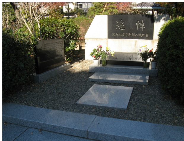
The Monument for Korean Victims, Yokoami-chō Park, Tokyo.

6,000 Koreans were killed by Japanese civilians. 8 Over 130,000 Koreans were living in Japan at that time. 9