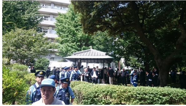
A right-wing rally at Yokoami-chō Park, surrounded by the police and bureaucrats.

The reason for their protest, they say, is that a certain passage is “demeaning to Japanese people.” This is the part that says, “In the turmoil of the Great Kanto Earthquake, as many as six thousand Korean people were deprived of their precious lives because of scheming and slanderous rumours, which were false.”