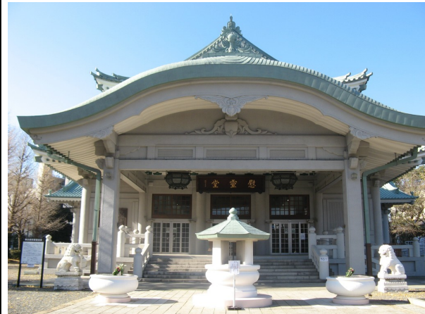
The Memorial Hall for Earthquake victims and Air-raid victims, Yokoami-chō Park, Tokyo. Downtown Tokyo was burnt down twice in September 1923 and in March 1945.

Collective memories are always contentious depending on crisscrossing positionalities. The historical debate between the former colonizer and the colonized has far-reaching and long-term consequences. Narusawa Muneo’s report below provides a detailed, behind-the-scenes view of the politics surrounding historically contentious matters about which Koike Yuriko, the outspoken conservative governor of Tokyo, has staked a position. Koike has abandoned the Tokyo governor’s long-established practice of formally issuing a eulogy in memory of the massacre of Koreans that following the Great Kantō Earthquake in 1923. This occurs at a time when a conservative women’s group and a Tokyo Assembly Member have launched a concerted effort to remove a contentious monument commemorating the massacre.