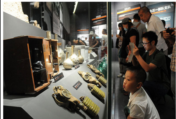
Visitors look at exhibits at the Museum of Evidence of War Crimes by Japanese Army Unit 731, in Harbin, Heilongjiang province, on Aug 15, the day the museum opened to the public.

"And I found out for the first time about the Americans. Why didn't they prosecute them? I felt that was really hard to accept. Definitely, Chinese people will feel that way," she said.