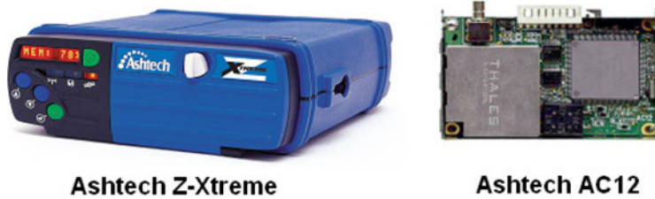
Figure 2. Geodetic-grade receiver ( left ) and OEM receiver ( right ) used in this study.