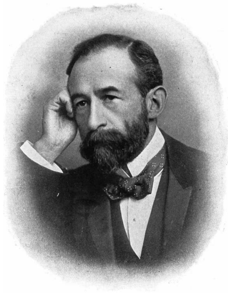
THE LATE WILLIAM JOHNSON WALSHAM.