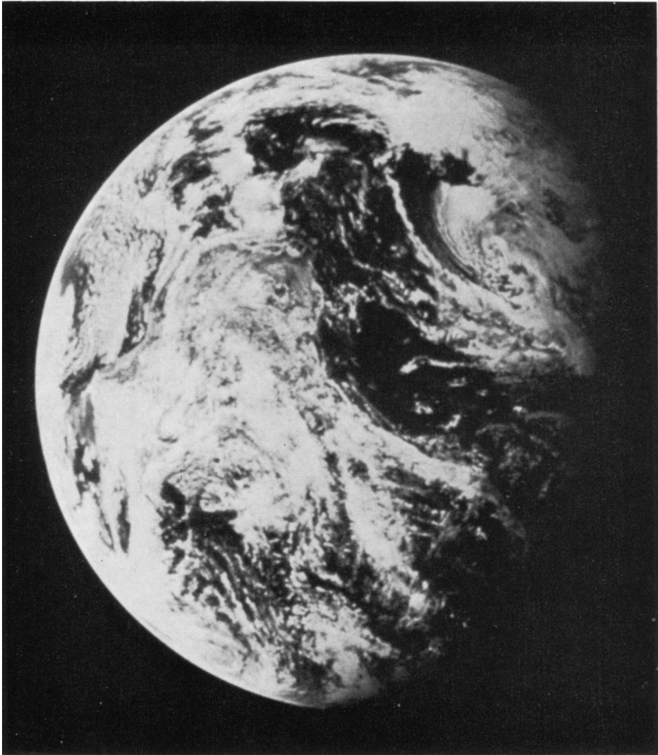
Fig. 3. Apollo photograph of the Earth taken at very roughly the same phase angle as the drawing of Venus in Figure 2. The Earth shows about 50% cloud cover.

in altitude of the respective landing sites of many kilometers. This appears to be inconsistent with the time delay radar measurements of topography performed at Lincoln Laboratory (Smith et al. , 1970), but the lateral resolution of the ground-based radar is some hundreds of kilometers; perhaps at a much smaller lateral resolution scale the topography is rougher. Why Venus should be rotating in a retrograde direction, why it should be locked or almost locked in rotation at moments to inferior conjunction with the earth (see, e.g., Gold and Soter, 1969), and why the clouds of Venus show a four day retrograde rotation are clearly important problems which are