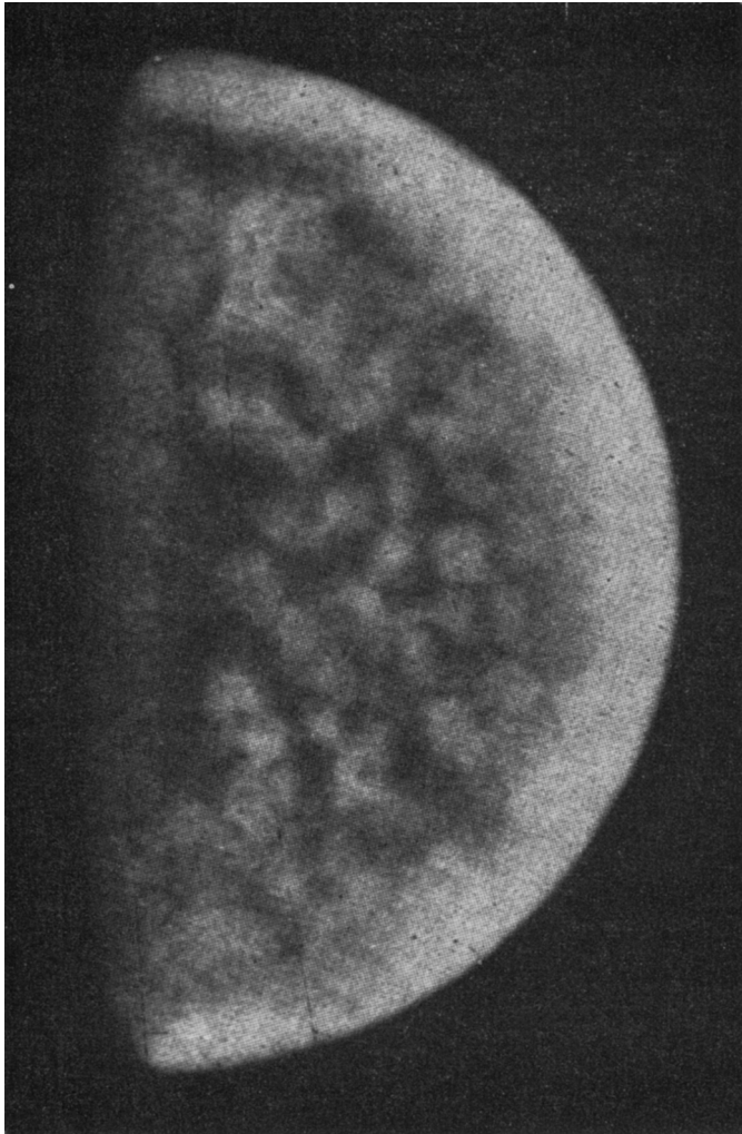
Fig. 2. An unusual drawing of Venus by J. H. Focas showing apparent resolution of the clouds into individual elements [taken from Atlas des Planètes (ed. by V. de Callataÿ and A. Dollfus), Gauthier-Villars, Paris, 1968].

all observers is that the Venus cloud deck is uniform and without breaks. But on rare occasion there have been reports of breaks in the clouds. One such event is recorded in the drawing by J. H. Focas, reproduced in Figure 2. We can compare this unusual representation of Venus with the usual representation of the earth in Figure 3 at