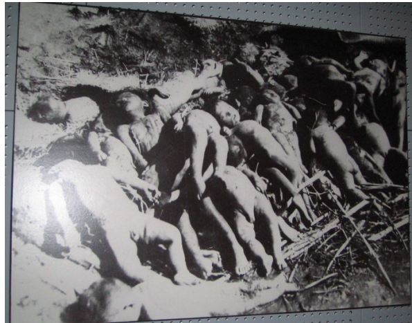
One of many photographs depicting the horrific consequences of Japanese chemical weapons in a special exhibit in the Northeast Martyrs Memorial Hall, Harbin

the Invading Japanese Army. The special exhibit was filled with gruesome photographs of piles of dead children, severed heads, and bodies disfigured by gas attacks.