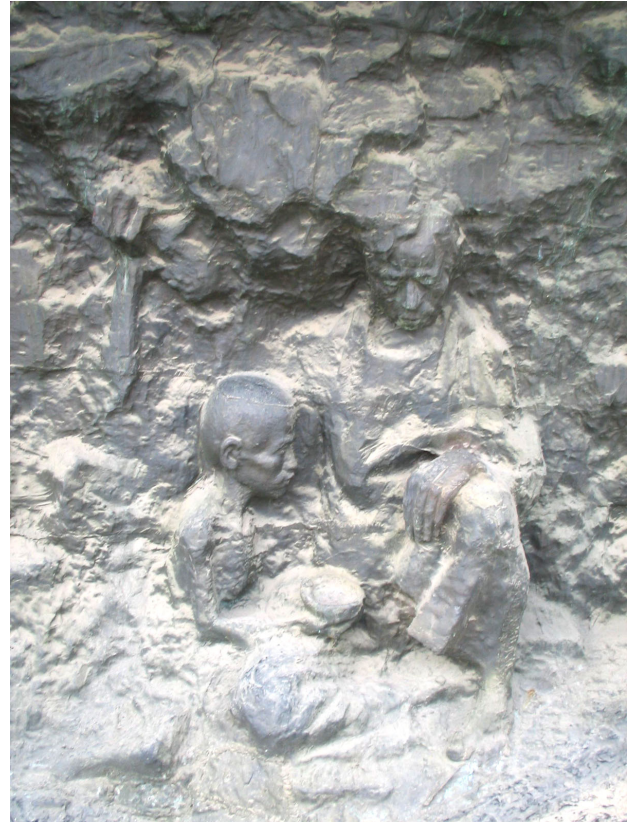
Close-up of relief on the front exterior walls of the September 18 History Museum

Indeed, from a distance, the movement of the relief along the wall does suggest sweeping dark brush strokes on white paper. Only close to the relief can one notice figures of suffering victims of the Japanese attack embedded in the bronze.