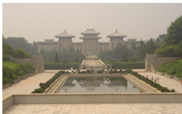
Main hall at Yuhuatai Martyrs Park in Nanjing