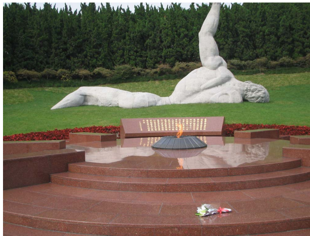
Unknown soldier statue, Longhua Martyrs Park, Shanghai