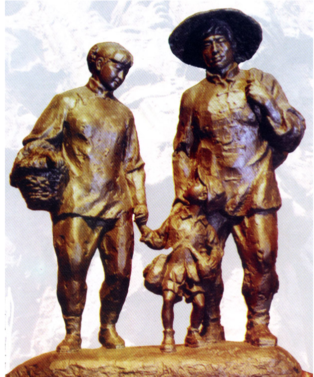
"The Monument to the Chinese Foster Parents," a sculpture near the end of the basic exhibition in the September 18 History Museum

Among the more powerful dioramas in the museum is one of life-size wax figures of Japanese war criminals being tried in a Shenyang court in 1956. The twenty-eight wax figures are dressed in black, and their heads are bowed in recognition of their guilt; behind them is a collage of photographic images of Chinese victims of the war with soaring planes, exploding bombs, and huge plumes of smoke in the background. The diorama captures guilt and contrition in a highly emotional visual language. Coming near the end of the exhibition, it offers powerful testimony to the Chinese nationalist take on the fair judgment of history. The exhibition ends with the bronze sculpture "The Monument to the Chinese Foster Parents," a memorial donated by Japanese to the Chinese parents who raised Japanese children orphaned by the war.