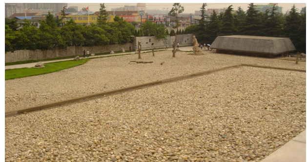
Graveyard grounds at the Nanjing Massacre memorial

Zen garden aesthetic to the graveyard. One cannot see the graveyard from the entrance square; it must be entered by first mounting some stairs, above which is a sign that reads “300,000 Victims,” and walking through an elbow-shaped passageway formed by cinderblock walls to each side. At the end of the enclosed passageway, a vista slowly opens up to reveal a landscape of scorched pebbles interrupted only by a few leafless trees and the statue of a mother who appears to be searching for her child.[47] Along the edge of the field of stones, the visitor follows a long stone relief, which forms a barrier between the graveyard and the outside world, depicting moments of horror suffered by Nanjing residents during the massacre. After passing by a memorial wall (labeled “The Crying Wall”) inscribed with the names of victims, the path then leads through two separate “bones” rooms—exhibits of actual bones of massacred victims found at the site.