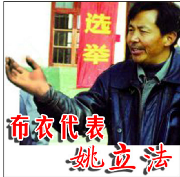
Election campaign poster for Yao Lifa.

Yao Lifa (born 1958) of Qianjiang City in Hubei is the first deputy to be elected through self-nomination to a municipal-level people’s congress. Yao, who runs a vocational school education program and teaches in an elementary school, began competing for a seat in the local people’s congress in 1987, when the election law was first promulgated. The law allows for self-nominated candidates, and Yao used this provision to run for office. Twelve years later, in 1998, he finally succeeded. Over the course of the next five years, Yao was a busy and controversial figure—he raised 187 of the 459 suggestions, opinions, and criticisms presented to the local people’s congress. Yao has campaigned on issues of excessive taxes and levies, seizures, corruption, and access to health care. Sensing a mandate, he railed against the detention of peasants who refused to pay illegal fees, collected more than 10,000 signatures criticizing a Party official, and denounced the waste of public money on dubious projects. 57 With Yao’s example and help, more independent candidates have turned to grassroots democracy; a small number have won seats in local congresses.