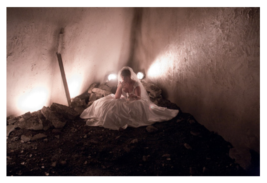
Figure 3 On Corporation Street (2016). Performer Niamh McCann, Image by Pat Redmond.

instrumental in shaping, developing and making On Corporation Street' (ANU Inquiries: On Corporation Street 2016).