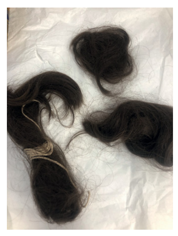
Figure 8 Female Hair forcibly removed during an 'Outrage' in the Irish Civil War, courtesy of the National Museum of Ireland Ireland and the Kevin Barry Family.

rather than extensive narrative exposition. Lowe recalls, 'It's also sad to read of the attempts the women made to protect themselves, even later in giving statements. They had no words for what happened to them physically; the language could be very reticent' (qtd in Irish Times , 2022). This point is further examined by McAuliffe, noting, '... anti treaty women were often arrested and held for days in local barracks where they suffered what they referred to as indignities. This obtuse language covers what were sometimes serious physical and sexual assaults. The later military pension application files of many these women indicate that their mental, physical and/or emotional health was seriously, sometimes permanently damaged by these experiences' ( The Wakefires Programme Note, 2022).