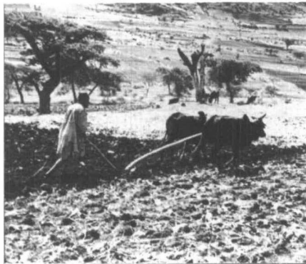
From A History of Ethiopia