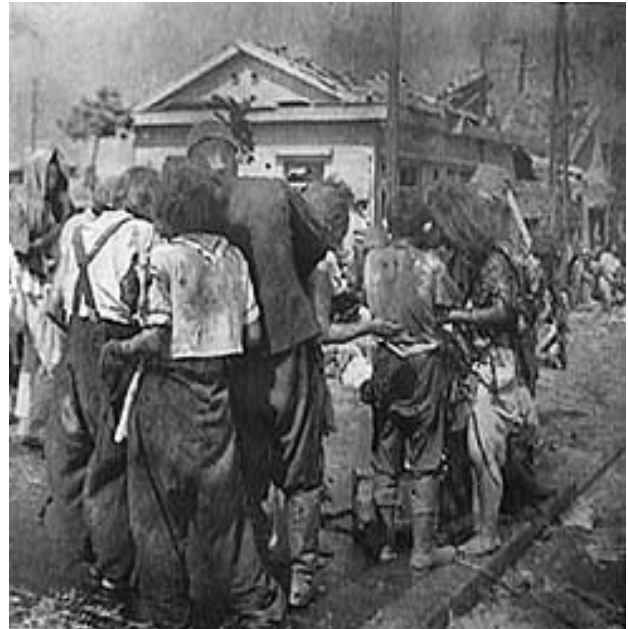
Hiroshima close up near the hypocenter three hours after the bomb

ruins. No wonder many Japanese refer to the bomb as pikadon and the mushroom cloud that so pervades the American consciousness has been superseded in Japan by images of the destruction of the two cities and the dead and dying.