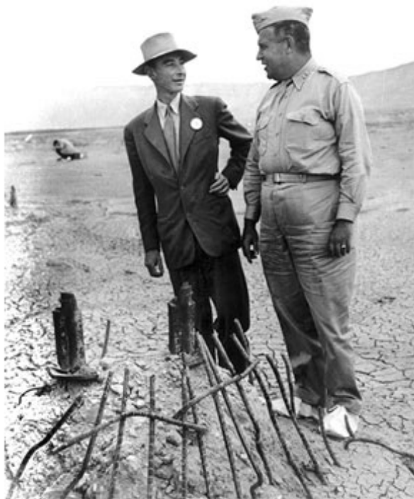
Oppenheimer and Leslie Groves at Trinity test site