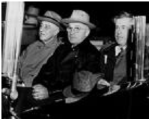
Roosevelt, Truman and Wallace

Throughout that first year, Henry Wallace, who Roosevelt had asked to stay on as Secretary of Commerce after Truman replaced him as Vice President, struggled valiantly to avert an arms race and ease the threat of nuclear war. When Wallace persisted in criticizing administration policy toward the Soviet Union and the bomb, Truman ousted him from the Cabinet. In his address to a national radio audience on the night he submitted his letter of resignation, Wallace again voiced the theme that provoked Truman's ire, charging that the U.S. government's present course may mean "the extinction of man and of the world." [26] That Truman bears so much responsibility for creating this perilous state of affairs, regardless of his conscious intentions, justifies the application of such a harsh standard of judgment and demands a closer look at the man and his early presidency. For if Harry Truman, a relatively decent man, could behave so irresponsibly, what assurance is there that future presidents, under comparable circumstances, might not do the same? In fact, several have already come frighteningly close.