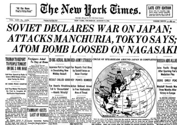
New York Times headlines Nagasaki bombing and Soviet entry into Manchuria, August 9, 1945

In the end, the Soviet invasion proved a far more powerful inducement to surrender than did the atom bombs. Japanese leaders, many demonstrating little concern for the suffering of their own people, had already witnessed U.S. firebombing and often near-total destruction of 64 cities without ending the war.