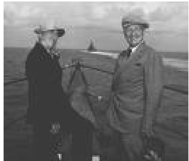
Truman and Byrnes en route to Potsdam, July 11, 1945

stressed that the future of mankind would be shaped by how such bombs were used and subsequently controlled or shared. [3] Truman recalled Stimson "gravely" expressing his uncertainty about whether the U.S. should ever use the bomb, "because he was afraid it was so powerful that it could end up destroying the whole world." Truman admitted that, listening to Stimson and Groves and reading Groves's accompanying memo, he "felt the same fear." [4]