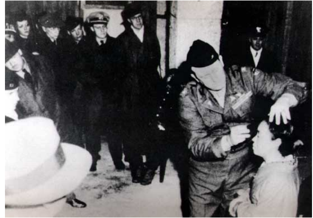
Atomic Bomb Casualty Commission examination

Commission (ABCC), which the U.S. set up in Hiroshima in 1947 and Nagasaki in 1948 to examine but not treat the bomb victims.