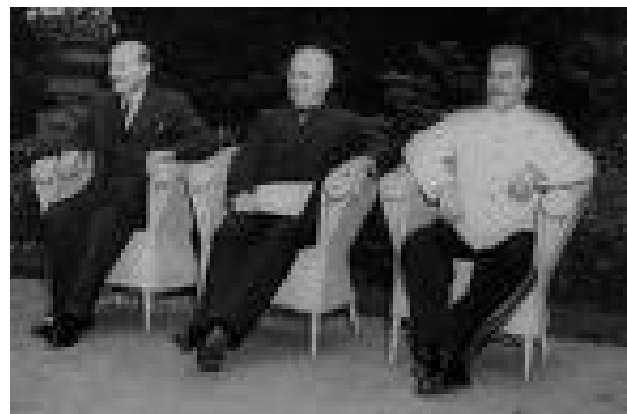
Atlee, Truman and Stalin at Potsdam

New York Times reported, “...Byrnes challenged today Japan’s argument that the atomic bomb had knocked her out of the war. He cited what he called Russian proof that the Japanese knew that they were beaten before the first atomic bomb was dropped on Hiroshima.”[45] Similar comments by Forrestal, McCloy, and Stimson show how widespread this realization was. But, at Potsdam, when Stimson tried to persuade Truman to alter his approach and provide assurances on the emperor in the Potsdam Proclamation, Truman told his elderly Secretary of War that, if he did not like the way things were going, he could pack his bags and return home.