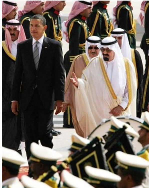
Obama with Saudi King Abdullah, 2010

In short, the wealth generated by the Saudi-American relationship is funding both the al Qaeda-type jihadists of the world today and America's self-generating war against them. The result is an incremental militarization of the world abroad and America at home, as new warfronts in the so-called War on Terror emerge, predictably, in previously peaceful areas like Mali.