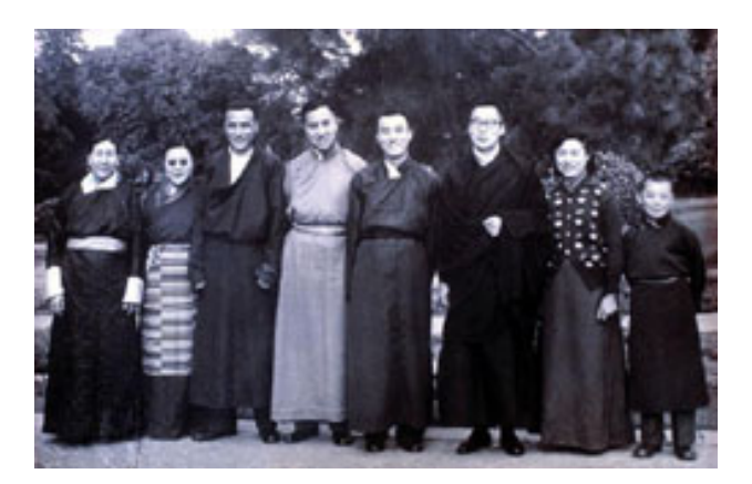
His Holiness (below, third from right) in exile in India in the early 1960s, photographed with his mother (far left), his older sister (second left), his three

Now the environment issue. Of course, I learned about the environment issue only after I went to India. When I was in Tibet, everything was very pure. I think the nature of god purified our air, our water, our soil. (Laughs heartily.)