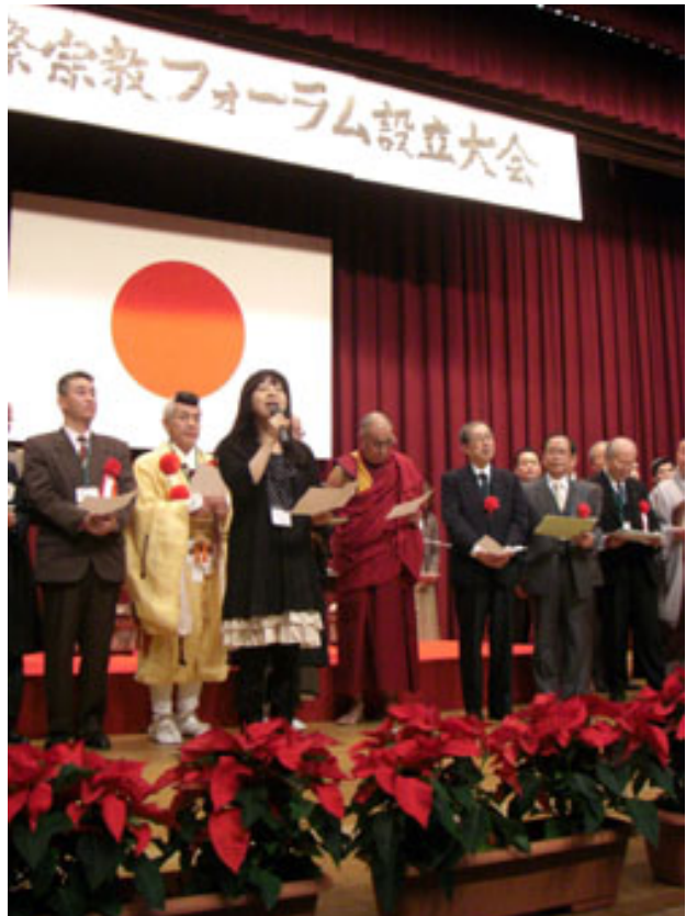
His Holiness and others celebrating the Interfaith Forum held in Ise, Mie Prefecture, last month.

On a global level, now the northerners, the industrialized nations, have too much consumerism and surplus. In other parts of the world, like Africa, Latin America, and also Asia, the basic necessities are not adequate and in some cases, starvation also exists. It is really terrible. So this gap is not only morally wrong but on a practical level is the source of problems. Now European countries, America, Australia and Japan are facing the problem of (unmanageable levels of) immigration.