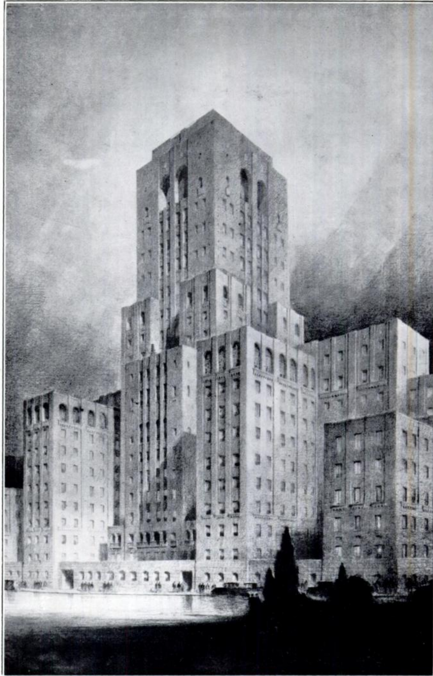
NEW YORK STATE PSYCHIATRIC INSTITUTE AND HOSPITAL AT THE MEDICAL CENTRE, NEW YORK CITY.